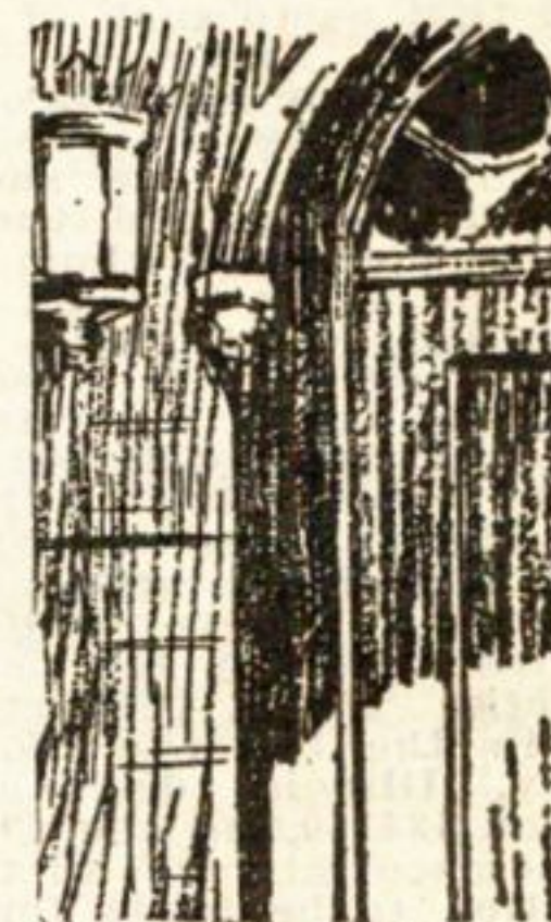
Perfect Oil Heat

Settle the questions in your mind about oil burners. See Kleen-Heet on the job. Not in the showroom but in a home near yours! We'll gladly arrange it. No obligation. Learn what users can tell you!