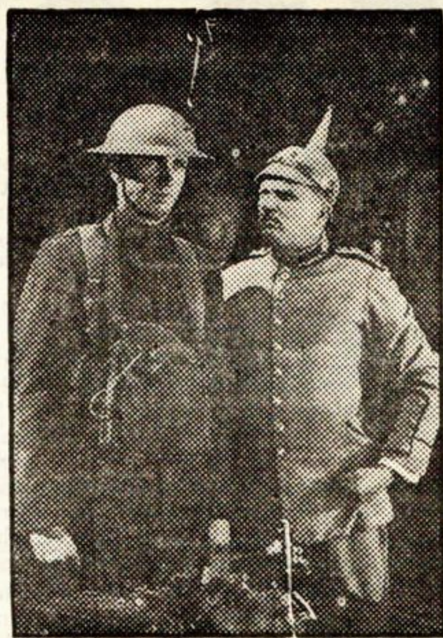
"The Lost Battalion"

September 1, will be all-comedy days at the Village theatre. There will be a feature length Christie comedy entitled "Stop Flirting" and Charlie Chaplin in "Pay Day", besides a Pathe news reel.