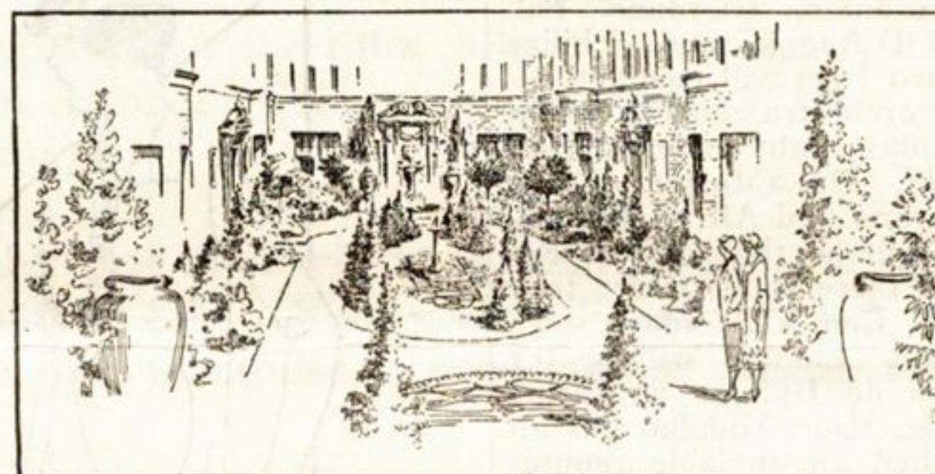
One of the Courts in the Linden Crest