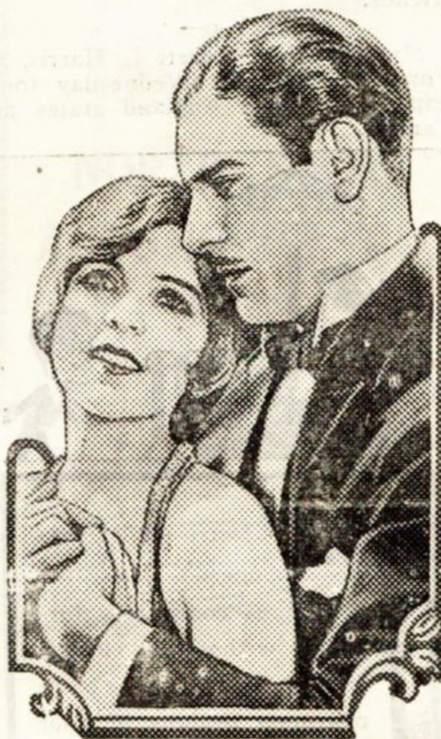
Ronald Colman and Blanche Sweet in "His Supreme Moment"

strangers during most of his movie career. Since he began in "Tol'able David" most of his roles have been of the frontier variety as in "The Covered Wagon," "The Trail of the Lonesome Pine" and "North of 36." In "The Sideshow of Life," "West of the Water Tower" and "The Fighting Coward" he was far from being a fashion model, but now everything seems to be different.