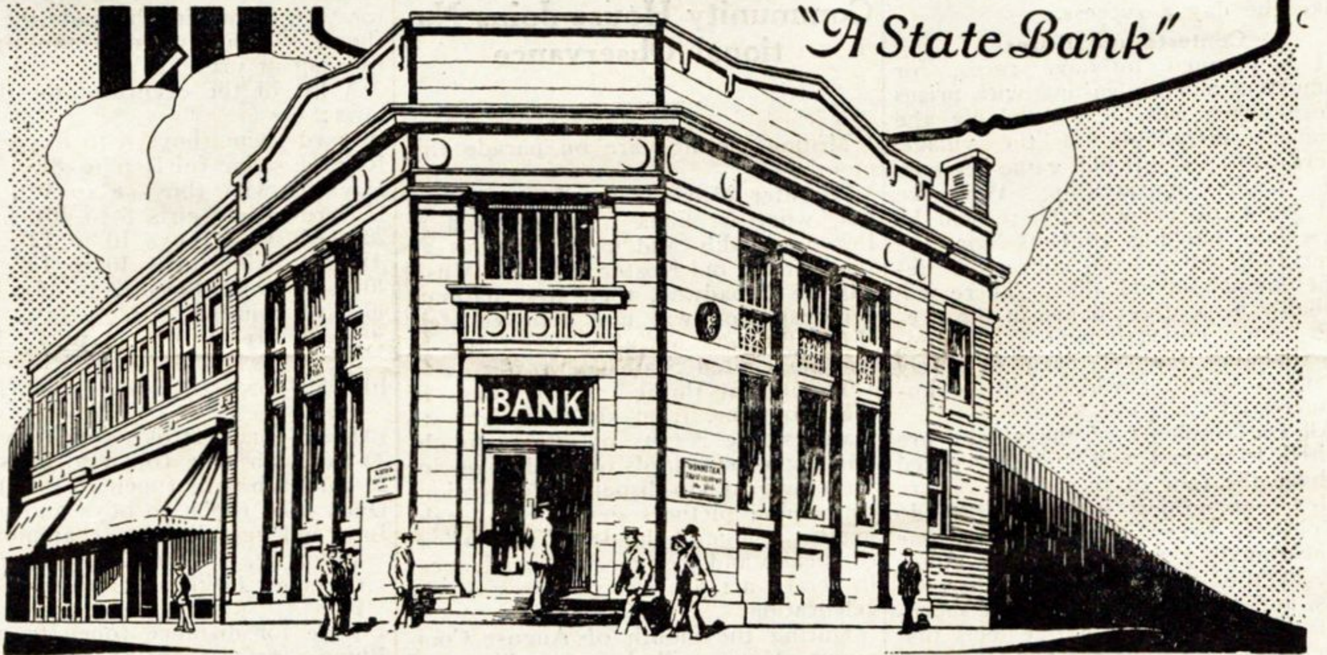
"A State Bank"