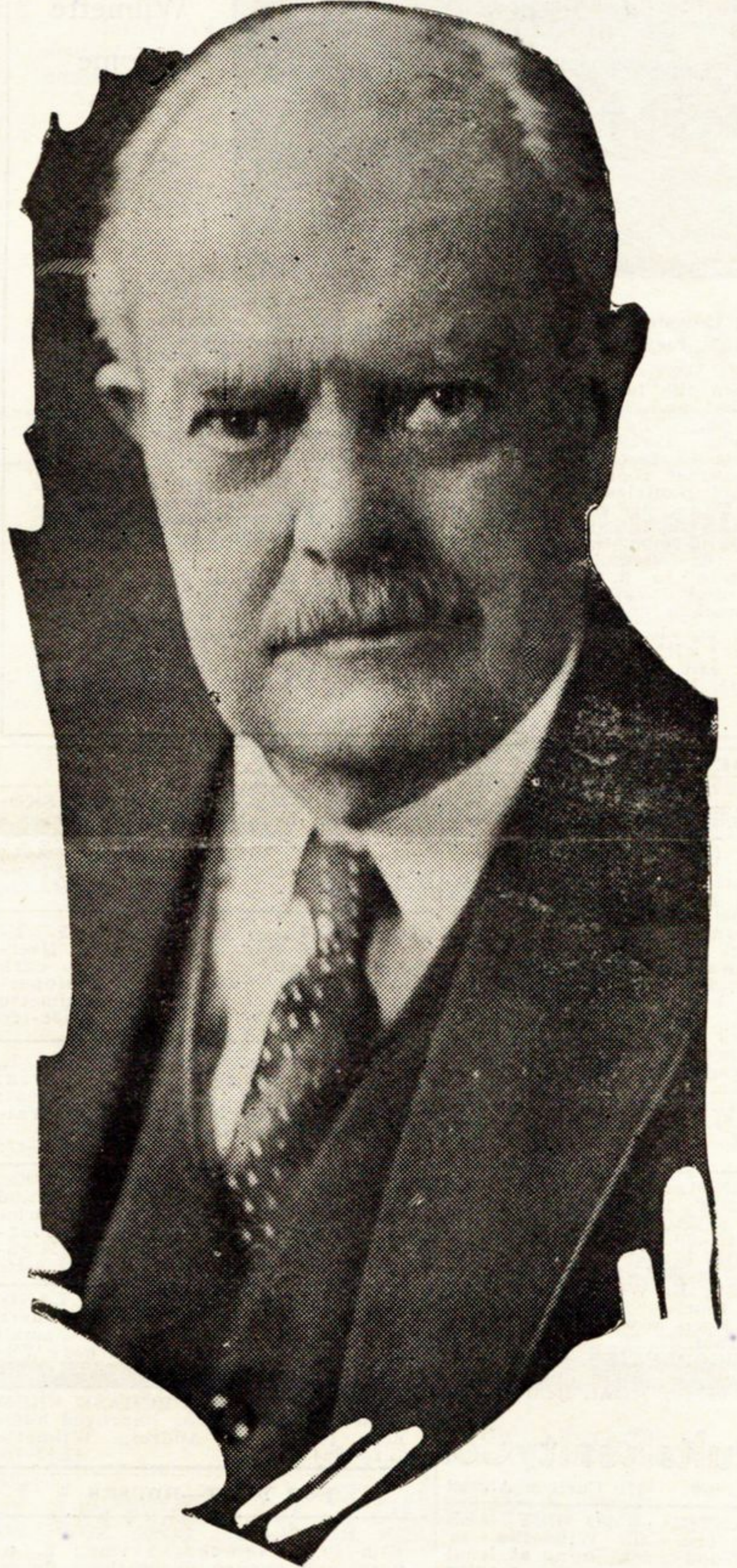
Edward F. Dunne