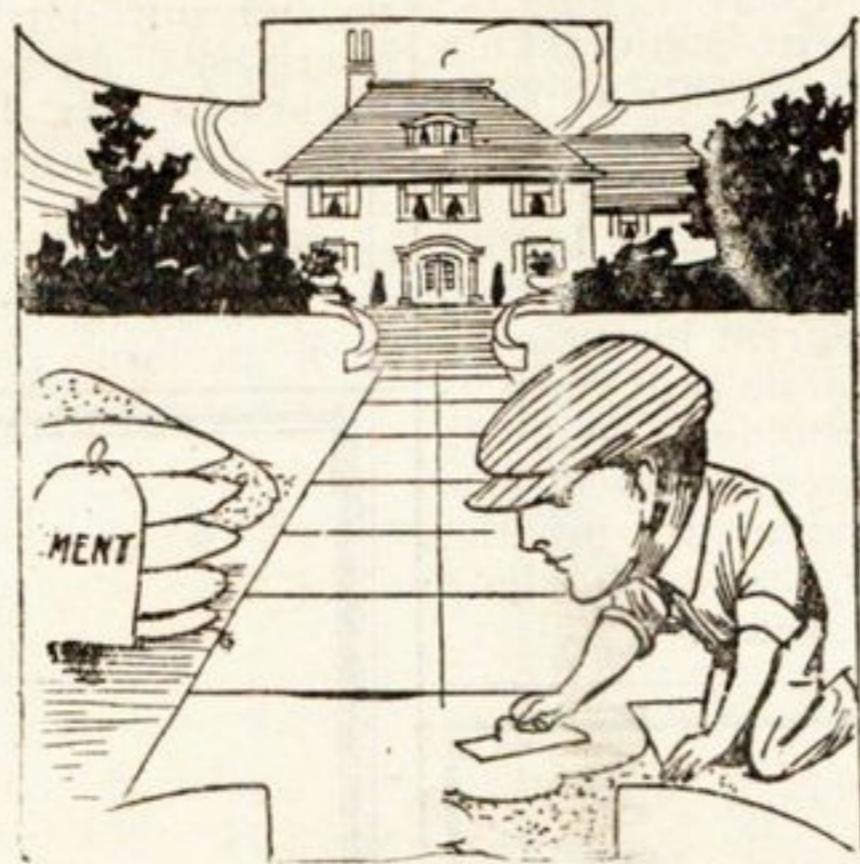
LAYING A CEMENT WALK

The attendance is expected to exceed that of last year when 75,000 persons and 17,000 automobiles filed into the grounds of the Great Lakes Naval Training station.