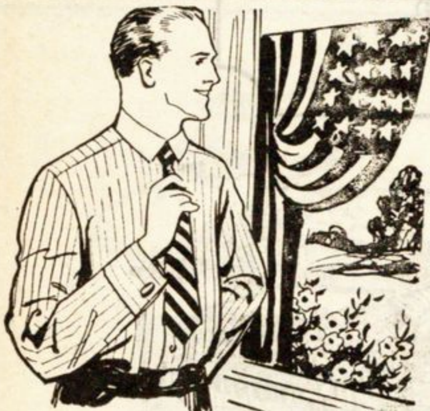
DRESSED FOR THE "4TH"

Here are the things a man needs for dress comfort and correctness—in a variety and price range such as you won't find elsewhere! Whether you plan a trip for the "4th", or remain in town, the men's-wear things which help to make for pleasure and comfort are obtainable here, with a saving in money and time!