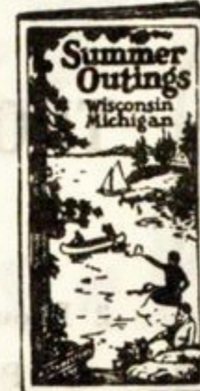
Illustrated folder containing maps, list of resorts, etc., sent free on request.