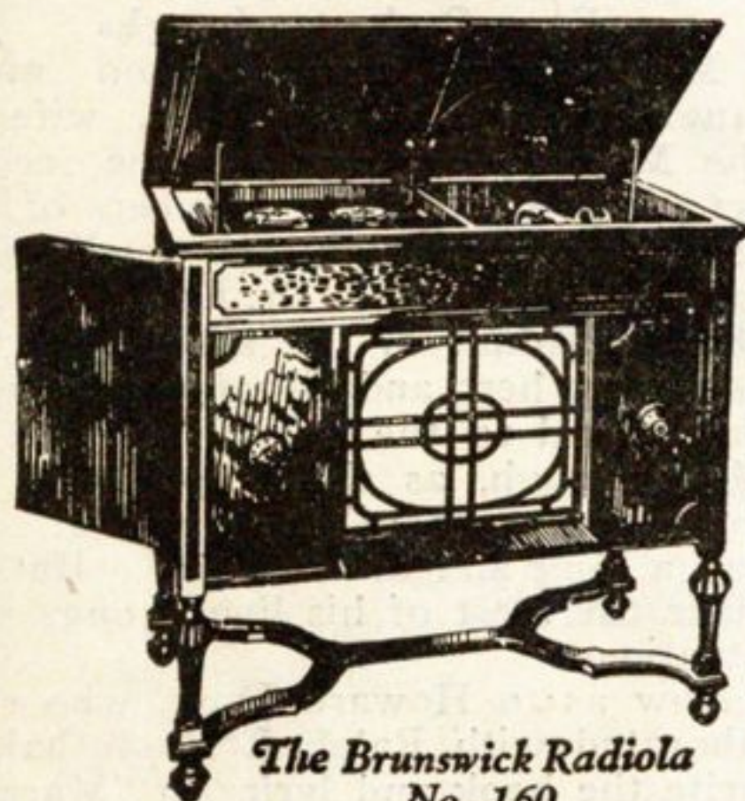
The Brunswick Radiola No. 160

No outside wires necessary —self contained.