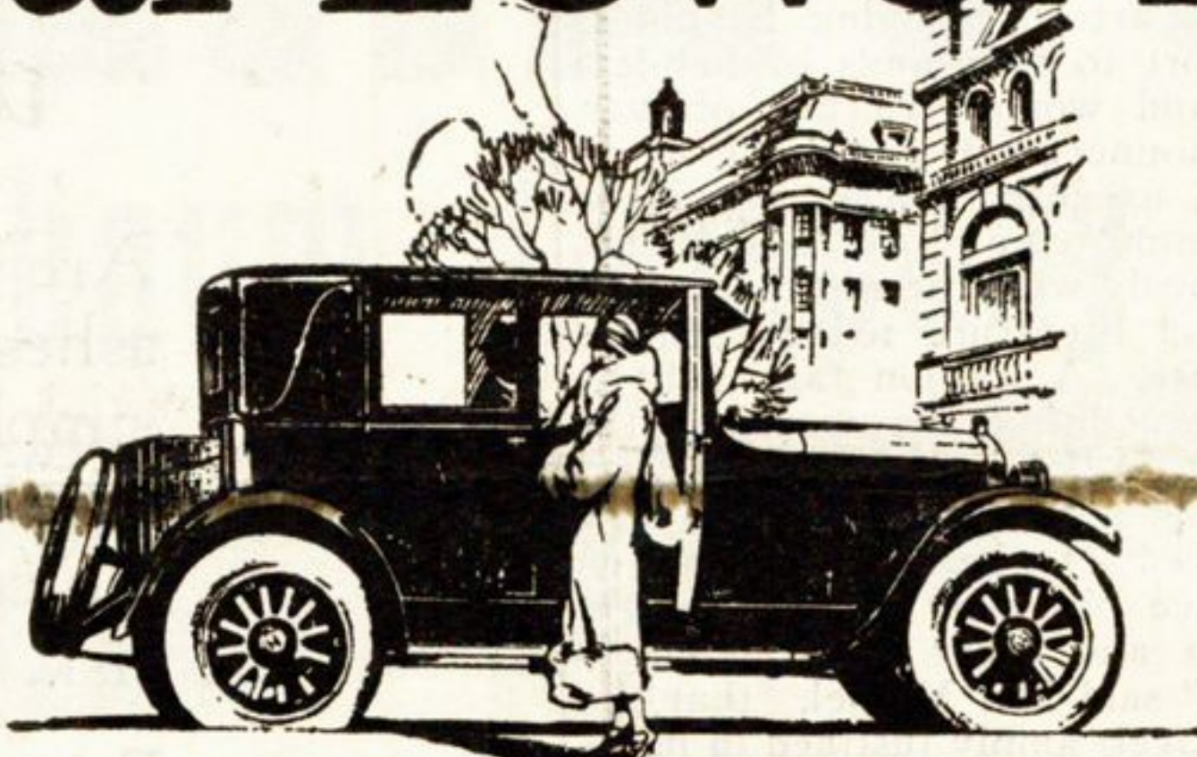
Three doors of standard sedan width. Easy and convenient for passengers to enter and leave both front and rear seats. Seating space, and leg space, for the comfortable accommodation of five passengers. The trunk at the rear is long and wide and deep. Balloon tires, Duco finish in Hupmobile blue or beige, nickel radiator, nickel and enamel head and cowl lamps. Complete equipment.

Hundreds of families are eagerly welcoming the Hupmobile Club Sedan, now that its low price brings it so close to open car levels. One of the most popular