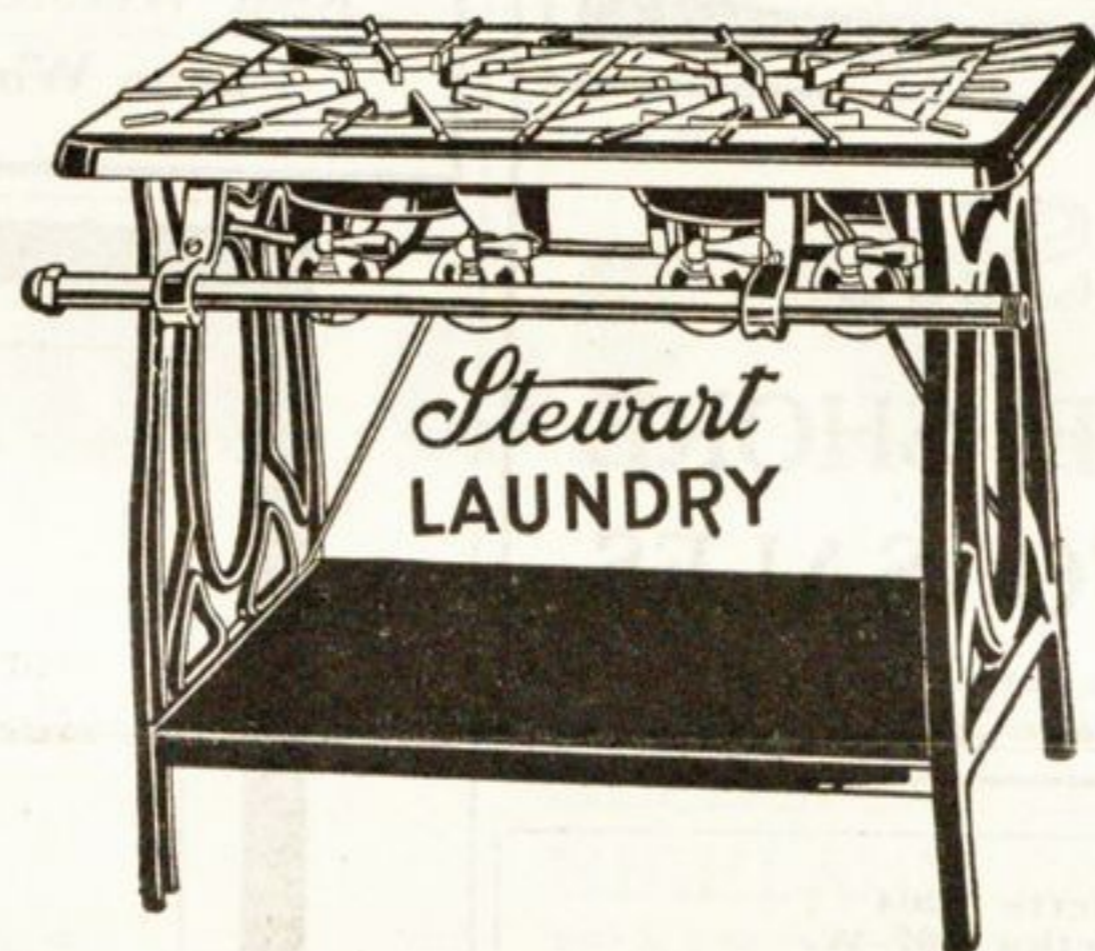
GAS LAUNDRY STOVE

One high grade gas laundry stove given away with the sale of each Washer, Dryer or Ironer during this March Sale