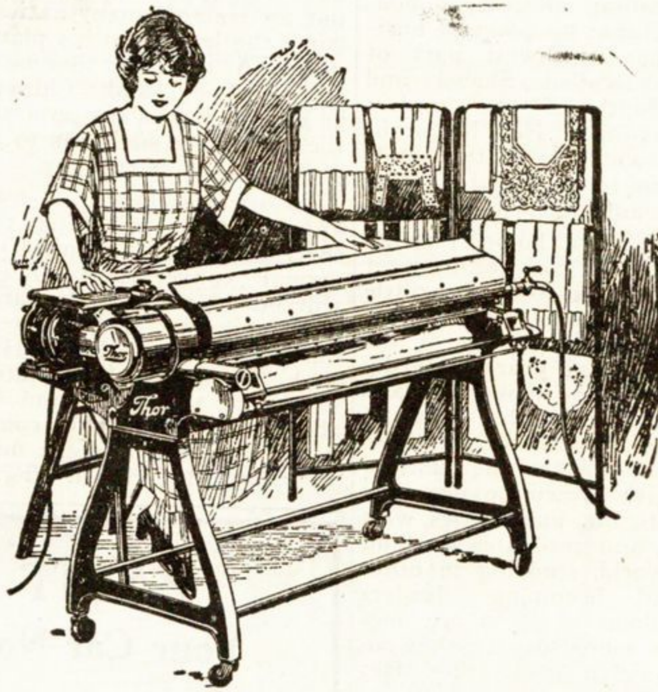
GAS HEATED CLOTHES IRONER