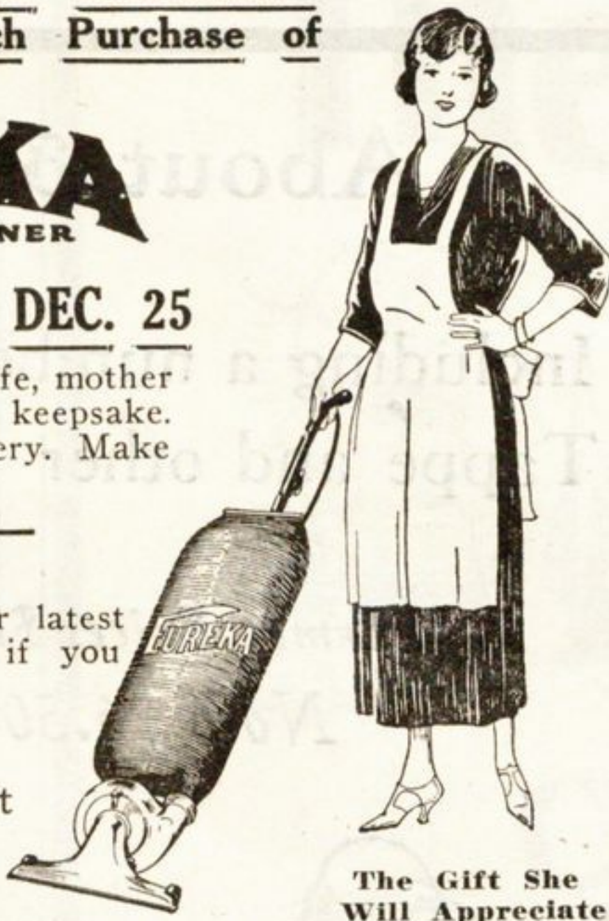
The Gift She Will Appreciate

554 Center Street Phone Winnetka 44 Winnetka, Ill.