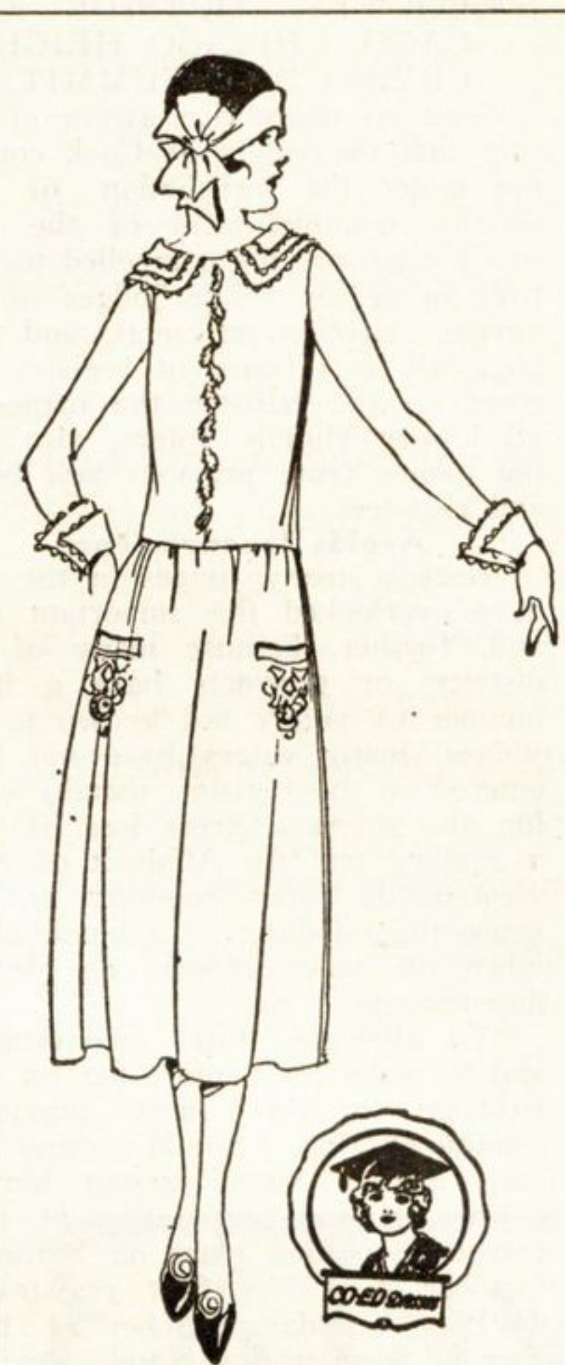
This Is Style 605

Youth has stamped her approval on this close-fitting bodice and gathered frock. Serviceable Poirer Twill was selected and to give a touch of brightness, there are attractive motifs embroidered in harmonizing colored chenille and tinsel on the pocket and on the bodice. A triple collar and deep cuffs are of sheer ecru batiste. Colors: Black, Navy and Brown. Sizes 14 to 20.