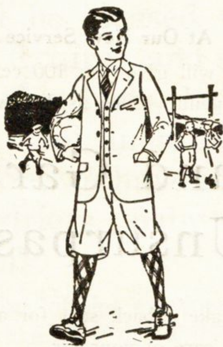
(7 to 17 years)

Made from excellent quality, wear-resisting, pure wool imported fabrics in a handsome assortment of new patterns and models. All made with two pairs of knickers.