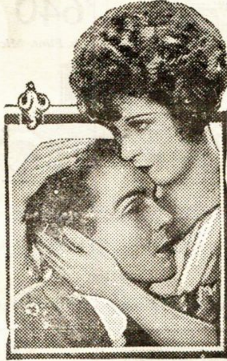
Glenn Hunter and Viola Dana in the Paramount Picture "Merton of the Movies"

Glenn Hunter has been identified with the character of Merton so long