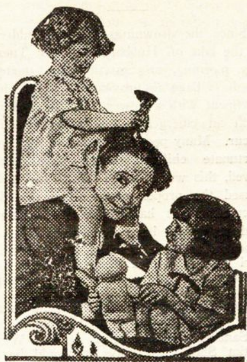
Scene from "Her Marriage Vow" A WARNER PICTURE

"Gee, Lizzie is a daisy, aint she?" exclaimed Charles to the two Joes. "It's too bad the body's all gone."