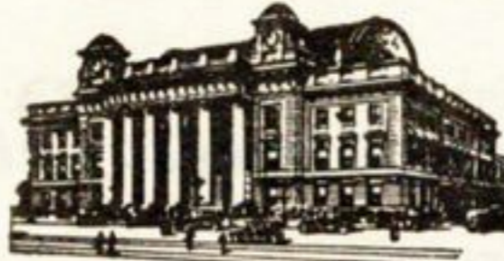
Chicago Passenger Terminal

Big reductions in season, 30-day and week-end tickets