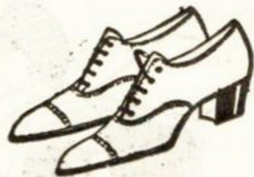
Black or Brown Kid and Combinations

FIVE famous comfort features are built into every pair of Dr. Kahler shoes to meet every comfort demand. But not with any sacrifice of style! Dr. Kahler shoes conform exactly to the individuality of your feet, giving comfort and freedom to every step you take. They support the ankle firmly and allow ample room for the toes. Expert fitters (not just salesmen) attend your needs.