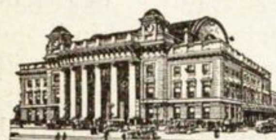
Chicago Passenger Terminal

Season, 30-day and week-end bargain vacation fares will be in effect