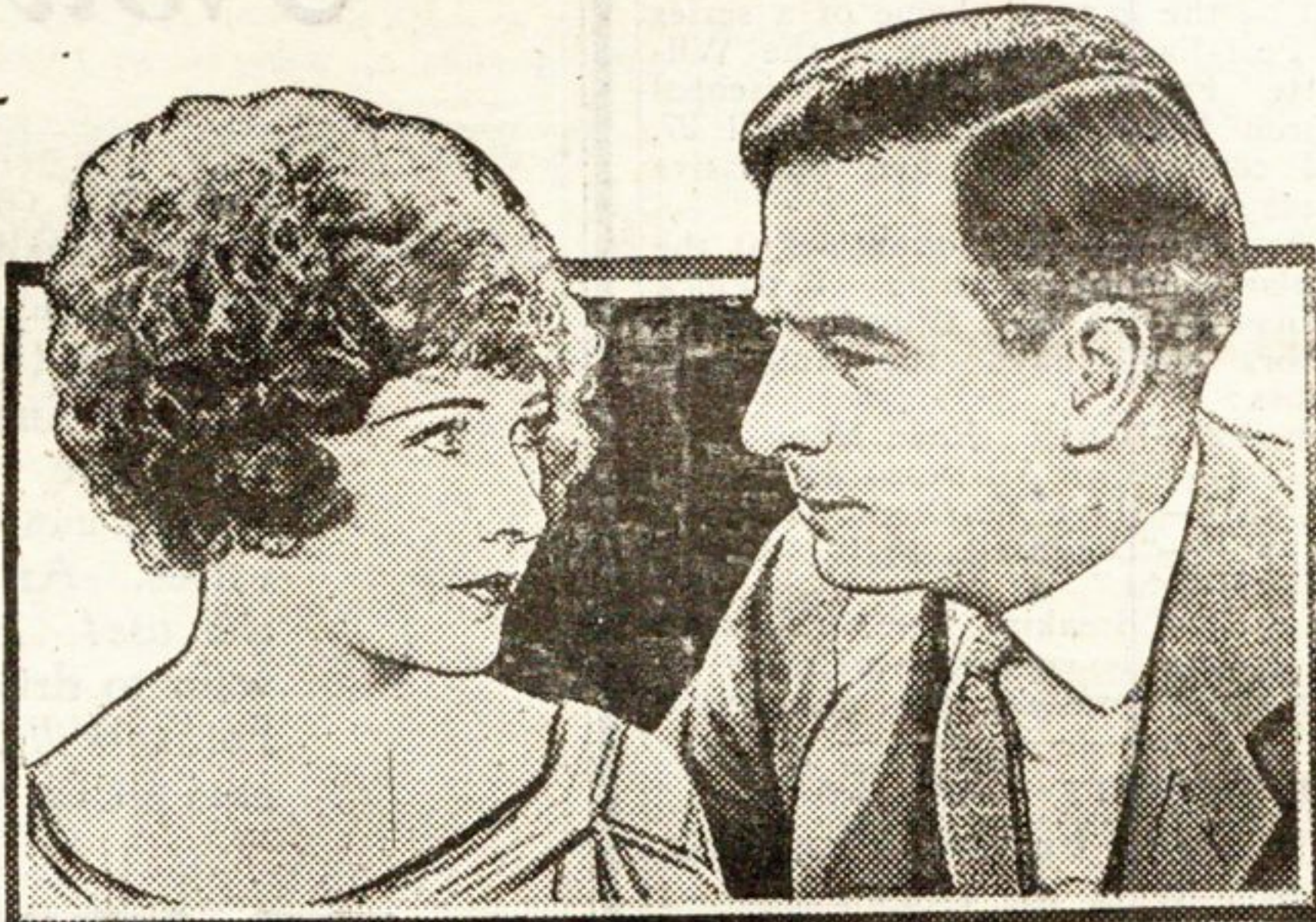
Anna Q. Nilsson and Milton Sills in Flowing Gold

services of Jacqueline Logan and others to good advantage.