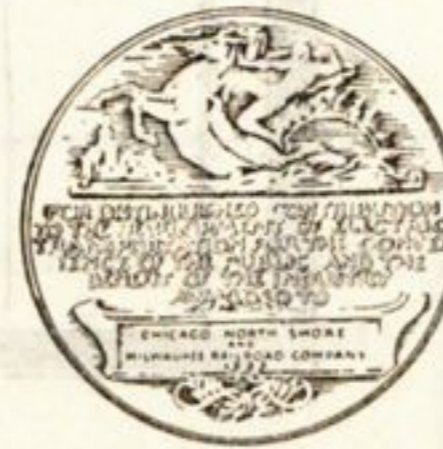
The Charles A. Coffin Medal awarded to the North Shore Line for distinguished contribution to the development of electrical transportation for the convenience of the public and the benefit of the industry.