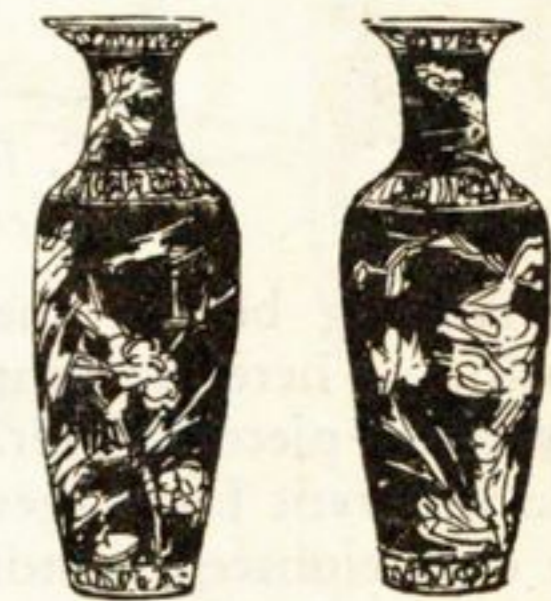
Chinese porcelain vases in Royal Blue with gold design—a stunning mantel decoration, $10 each.

You will like the suite sketched above. It is well made and covered with a fine grade of mohair. Come in and let us show it to you.