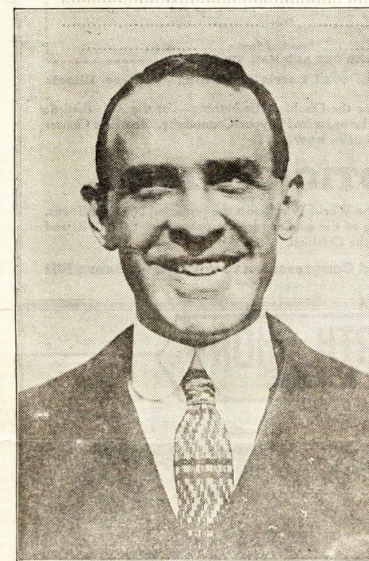
HE'S THE "BABY" OF THE 68TH CONGRESS