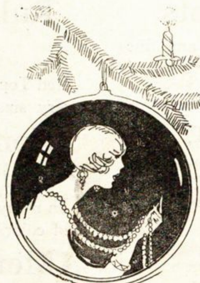
Pearl Bead Necklaces $3.95 to $19

Choker strands up to 72 inch lengths, in graduated and even beads, carefully strung on strengthened silk or metal. Choice of white, shell lustre or gray.