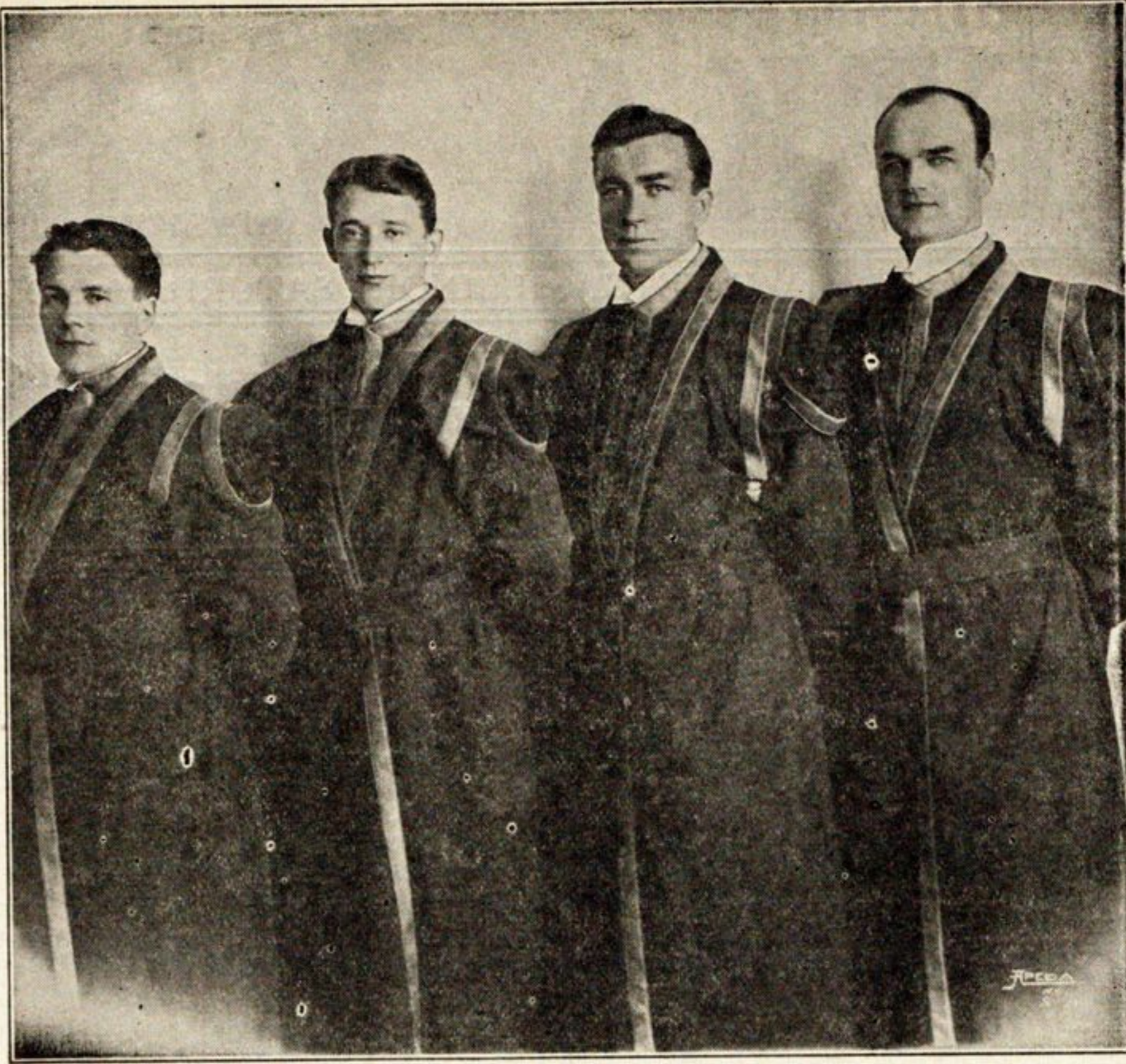
Russian Cathedral Quartet which sang at the Wilmette Sunday Evening Club, Sunday, October 28.

"Combining as it does the work of the public schools and the churches, the Wilmette Sunday Evening Club is a community builder. Messages, educational, religious and aesthetic, brought to us weekly by the nation's best talent, strengthen the thinking of the public school patrons and the church goers. This creates a finer atmosphere for teachers and preachers, and contributes to the progressiveness of our schools and churches."