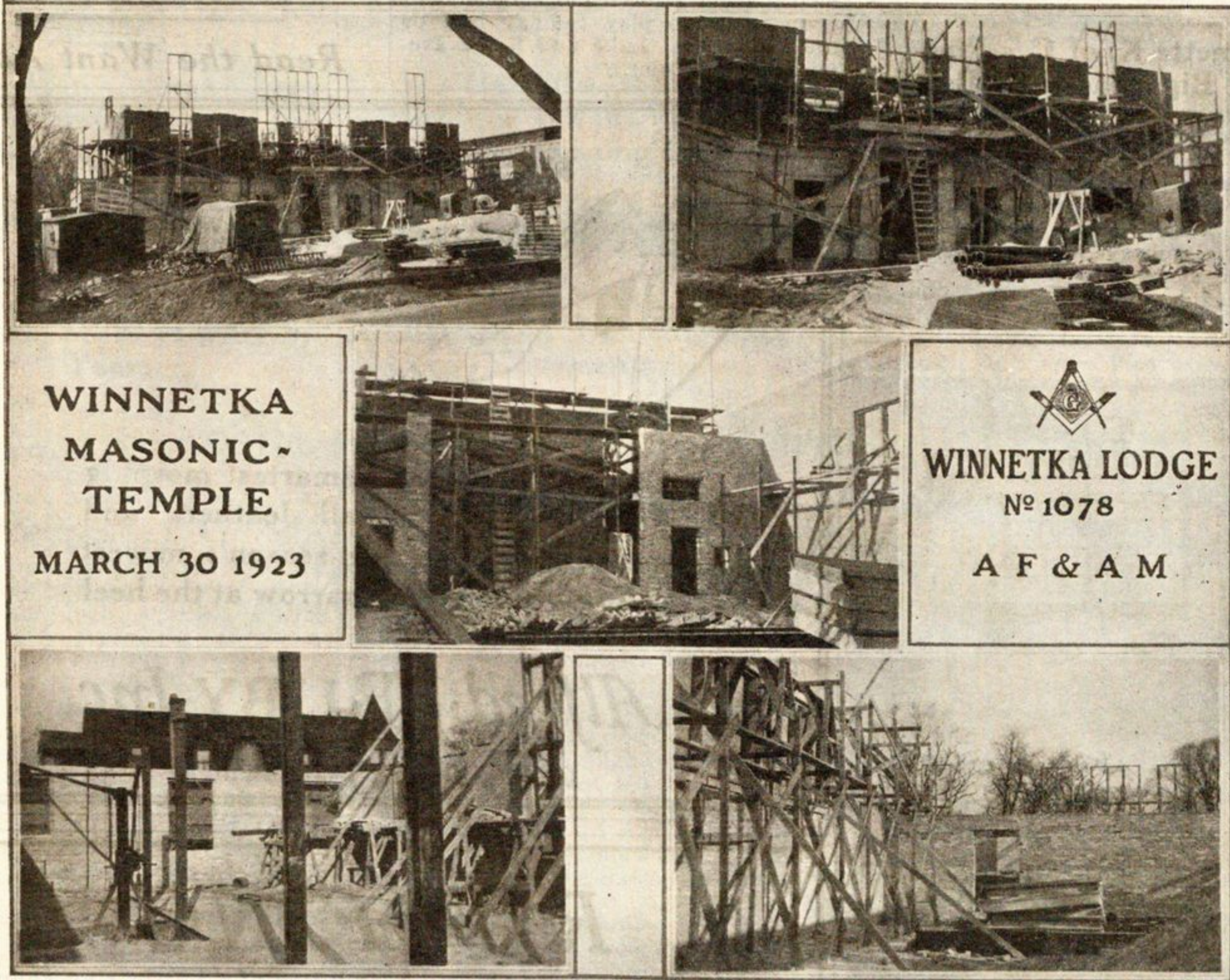
WINNETKA MASONIC- TEMPLE MARCH 30 1923