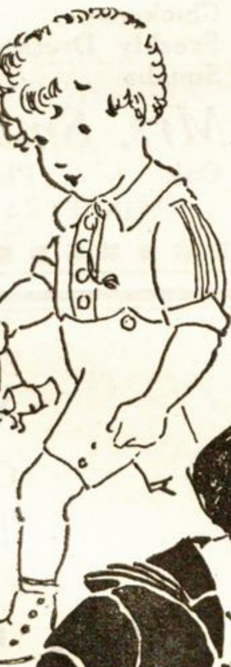
Oliver or middy suits of tan soisette, ages 4 to 7, $2.75.

Children's three-quarter cotton and lisle hose in plain colors and plain with fancy turned-over cuffs, sizes 6 to 10; prices 50c to $1.65.