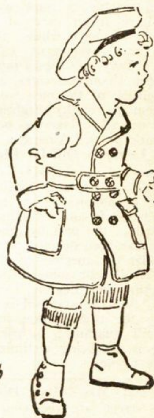
Boys' Spring Coat

Of fleecy tan Aire-dale, sizes 1 to 8, $18.50. Tams to match, $3.50.