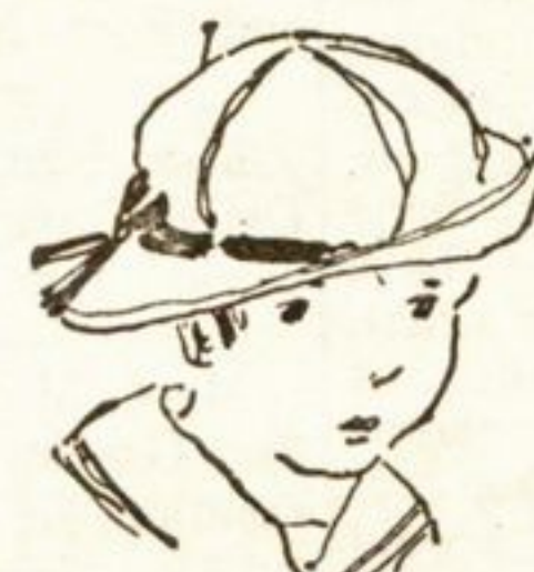
Soft finished chevots, plain brown or blue cloth, $3.50.