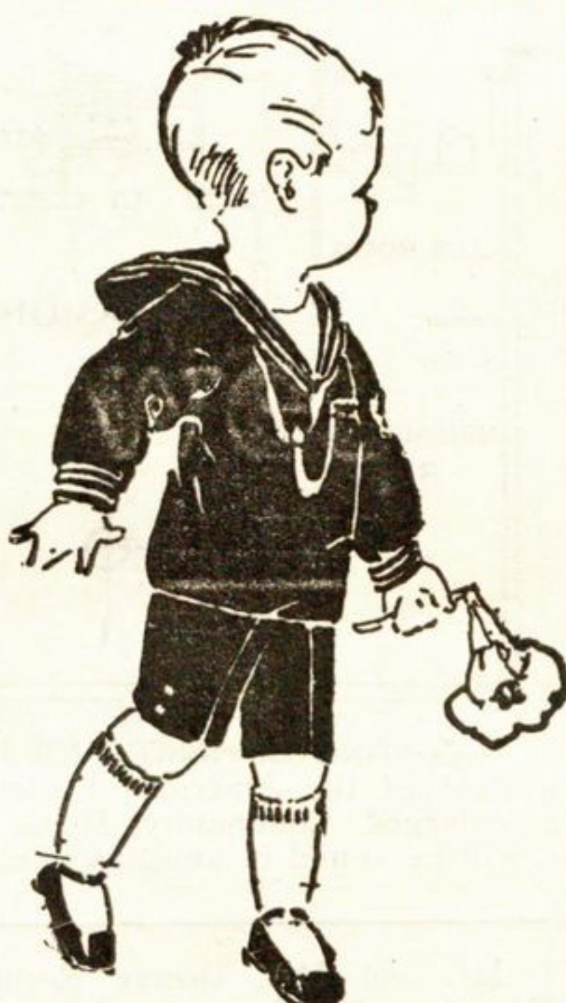
Middy Suits Of navy French serge, regulation trim med. Sizes 3 to 8, $6.50.

HERE, at headquarters for boys' clothing and furnishings, are those very values you seek in boys' wear—long life of garment, style and reasonable prices, with large and varied assortments from which to make your selections.