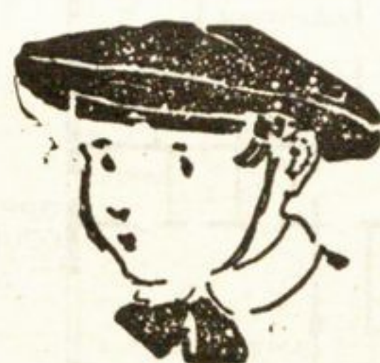
Blue serge tams, Ages 2 to 8, $3.00.