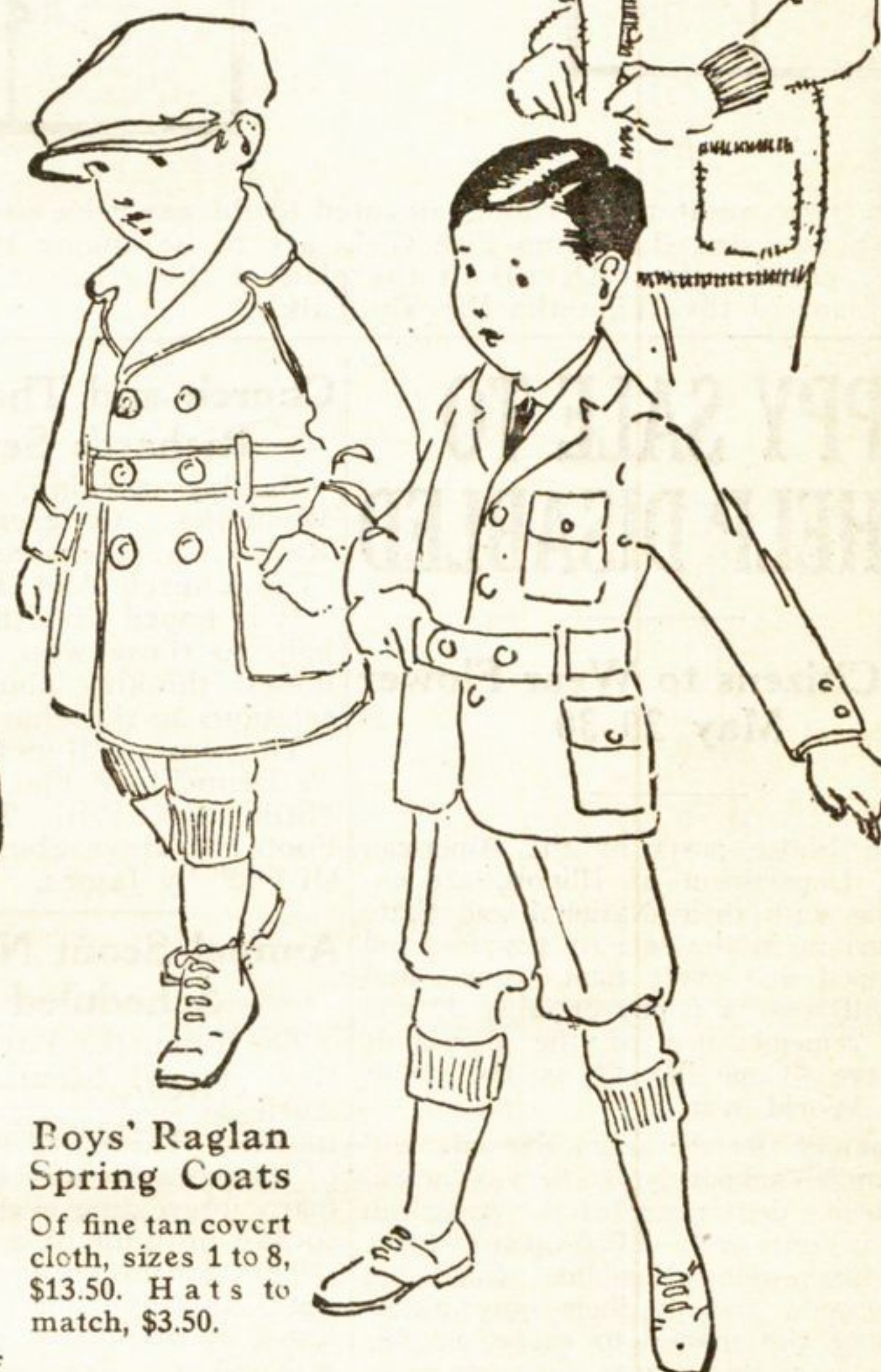
Boys' Raglan Spring Coats Of fine tan covrct cloth, sizes 1 to 8, $13.50. Hats to match, $3.50.