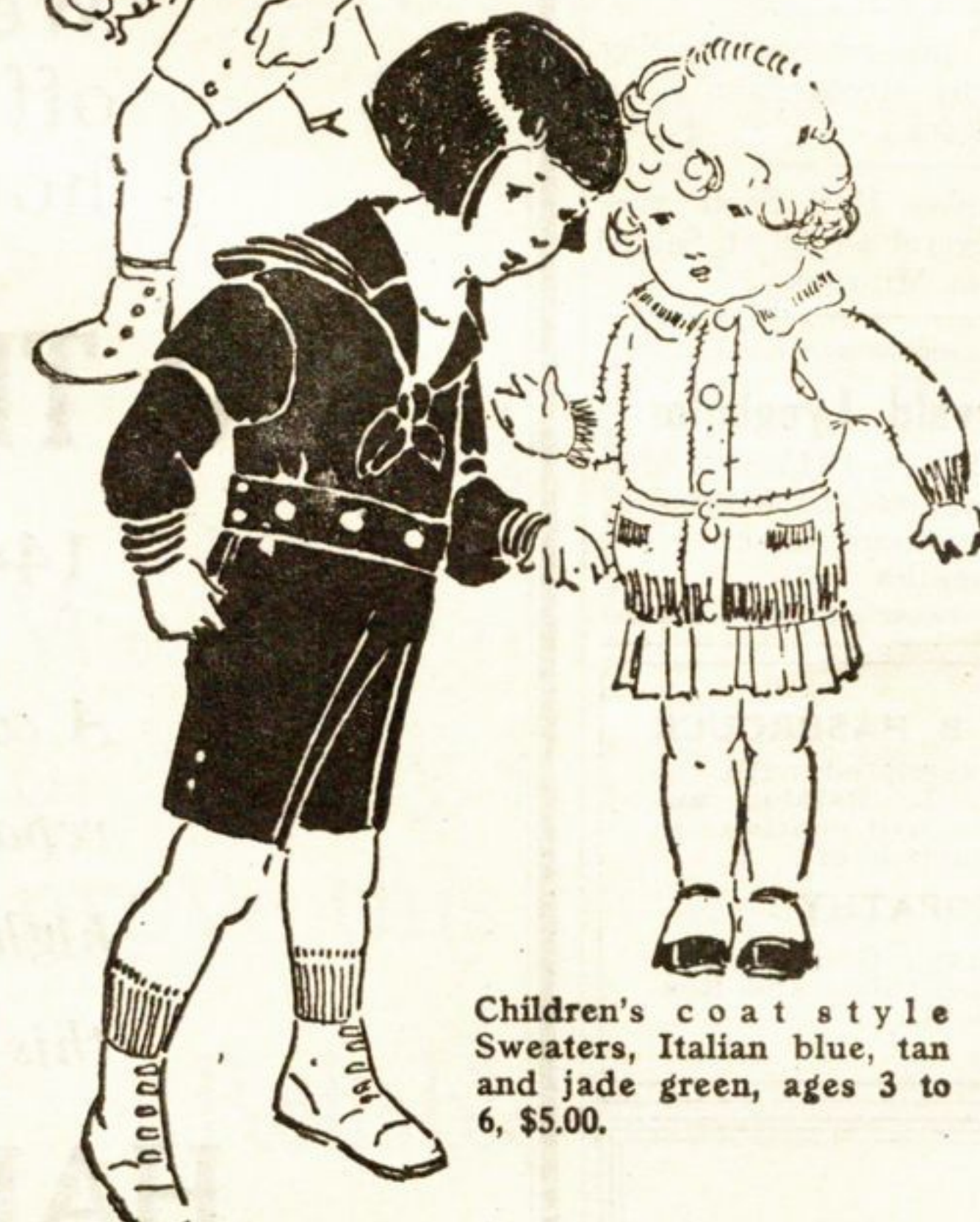
Children's coat style Sweaters, Italian blue, tan and jade green, ages 3 to 6, $5.00.