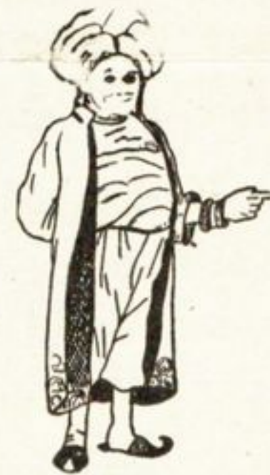
As if by Magic