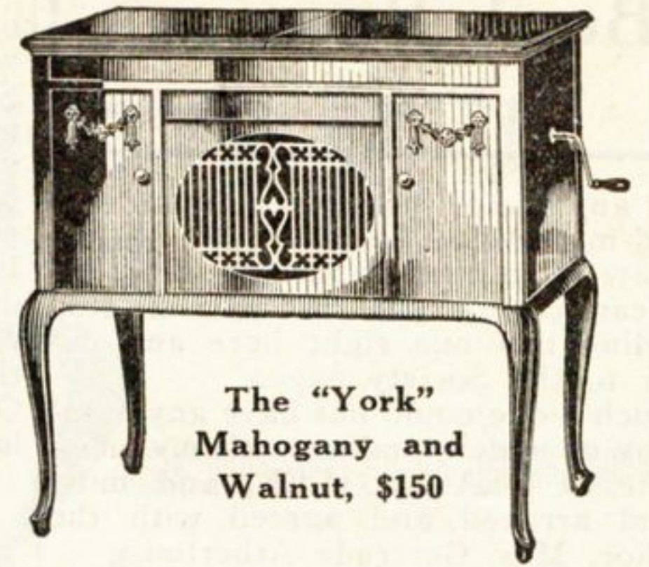
The "York" Mahogany and Walnut, $150

The sweetest tone—the clearest reproduction are most desired by the music-lover. And the