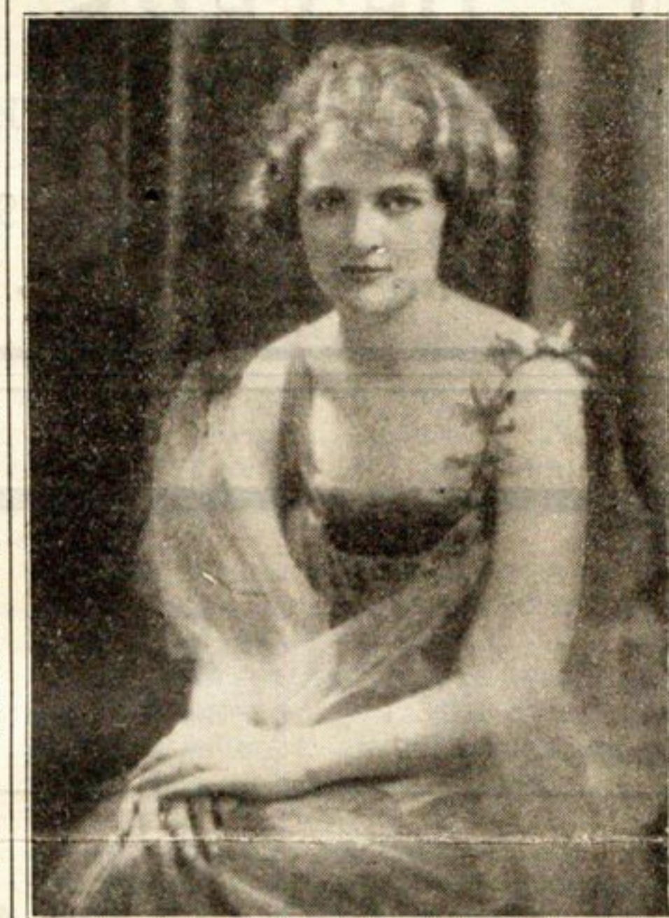
Your photograph by appointment in your home or at our studio