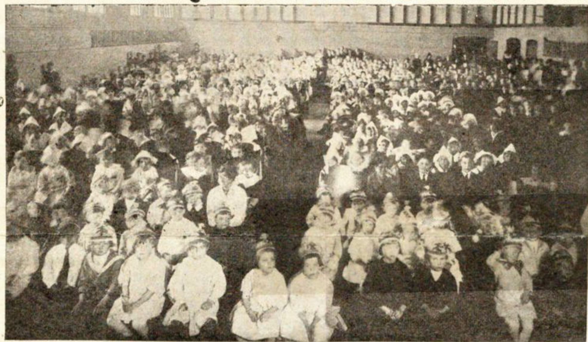
A Children's Meeting in the Gymnasium