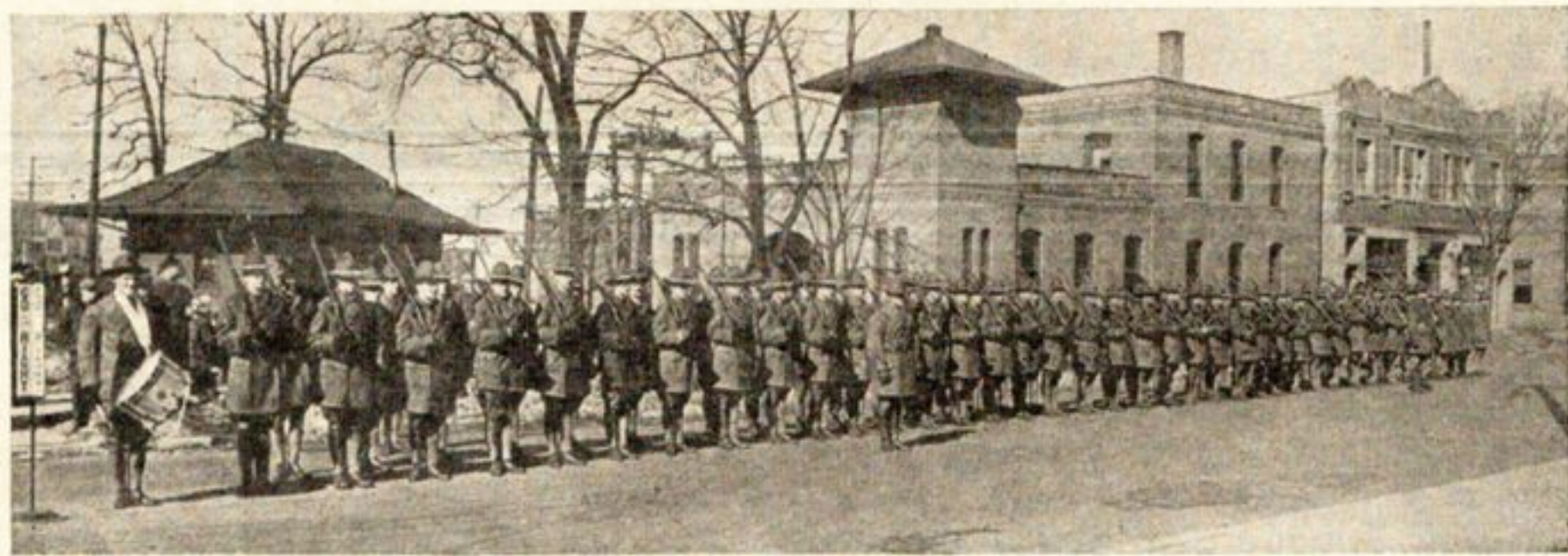
Company "A," Illinois Reserve Militia used Community House as a Drill Hall and Armory During the War