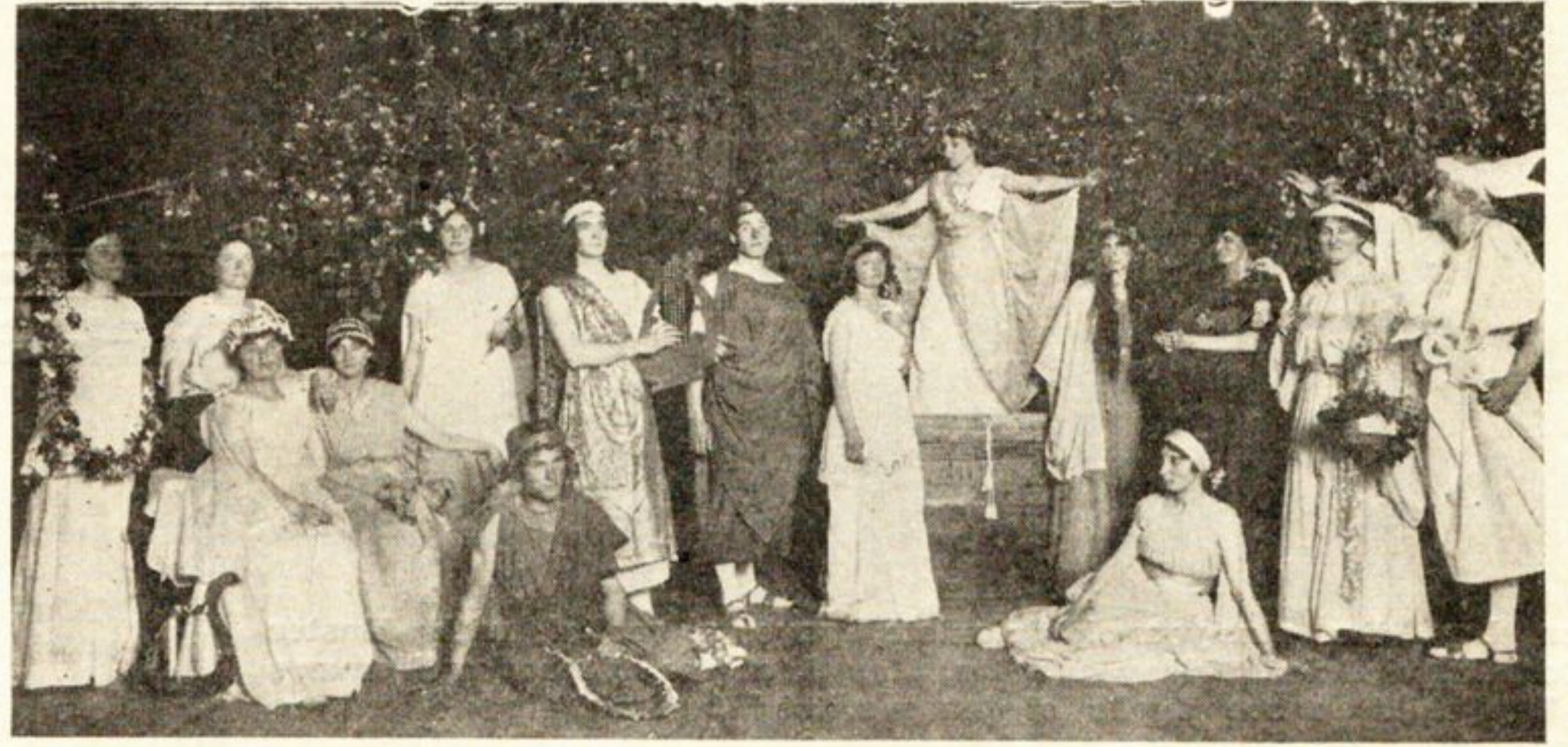
A Dramatic Club