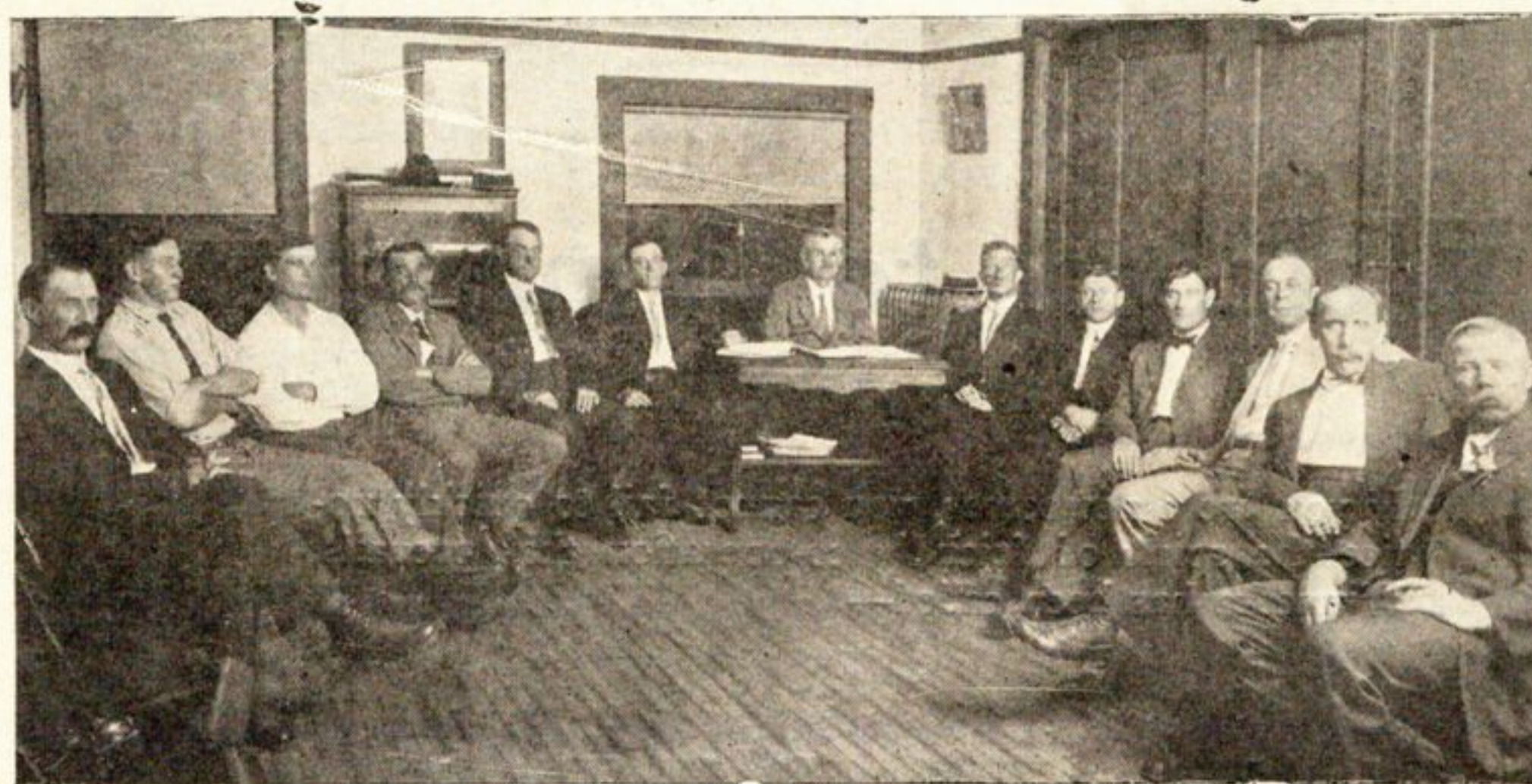
Lake Shore Horticultural Society