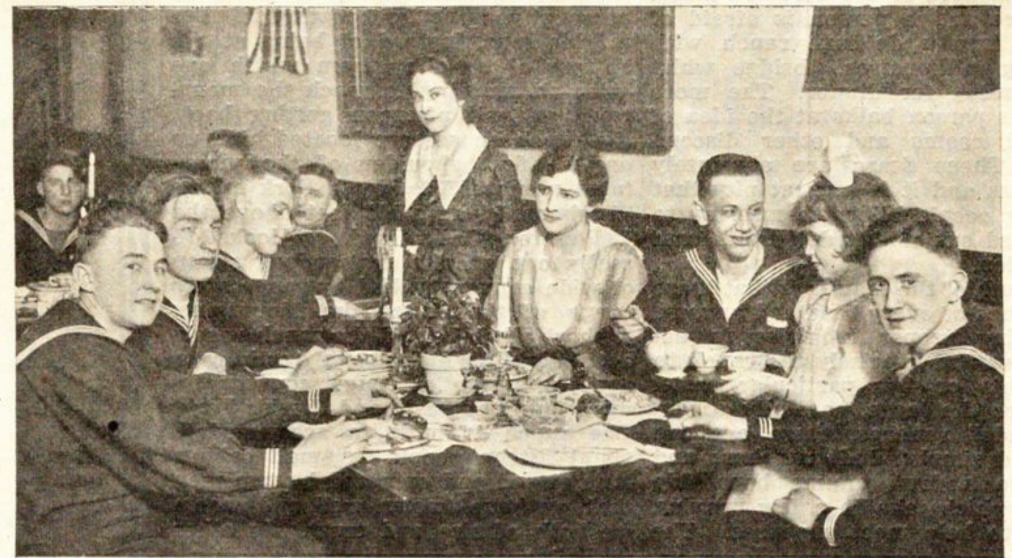
The Neighborhood Room Belonged to the Army and Navy for Two Years