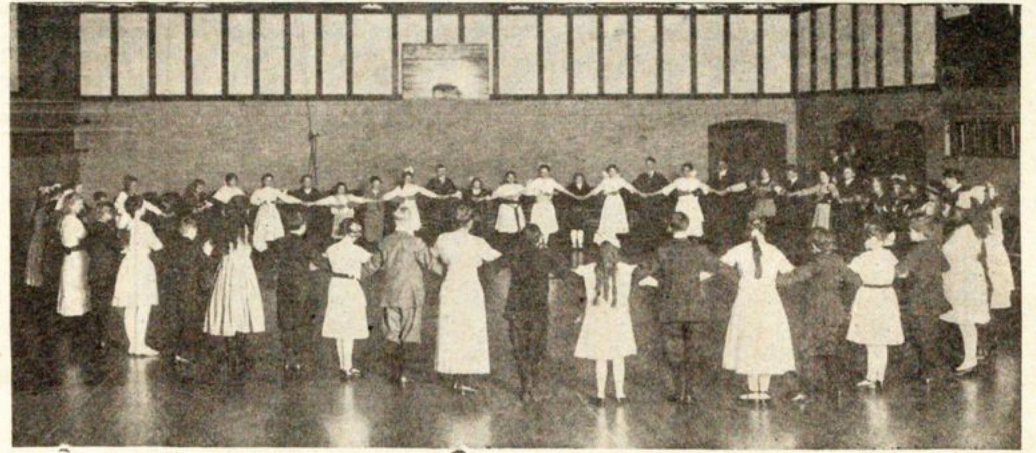
A Young Folks' Dancing Class