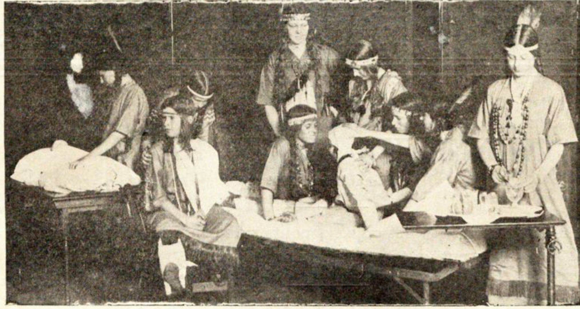
Camp Fire Girls Learning "First Aid"

After Eleven Years These Groups and Others 59 in All, Need More Room and Better Facilities