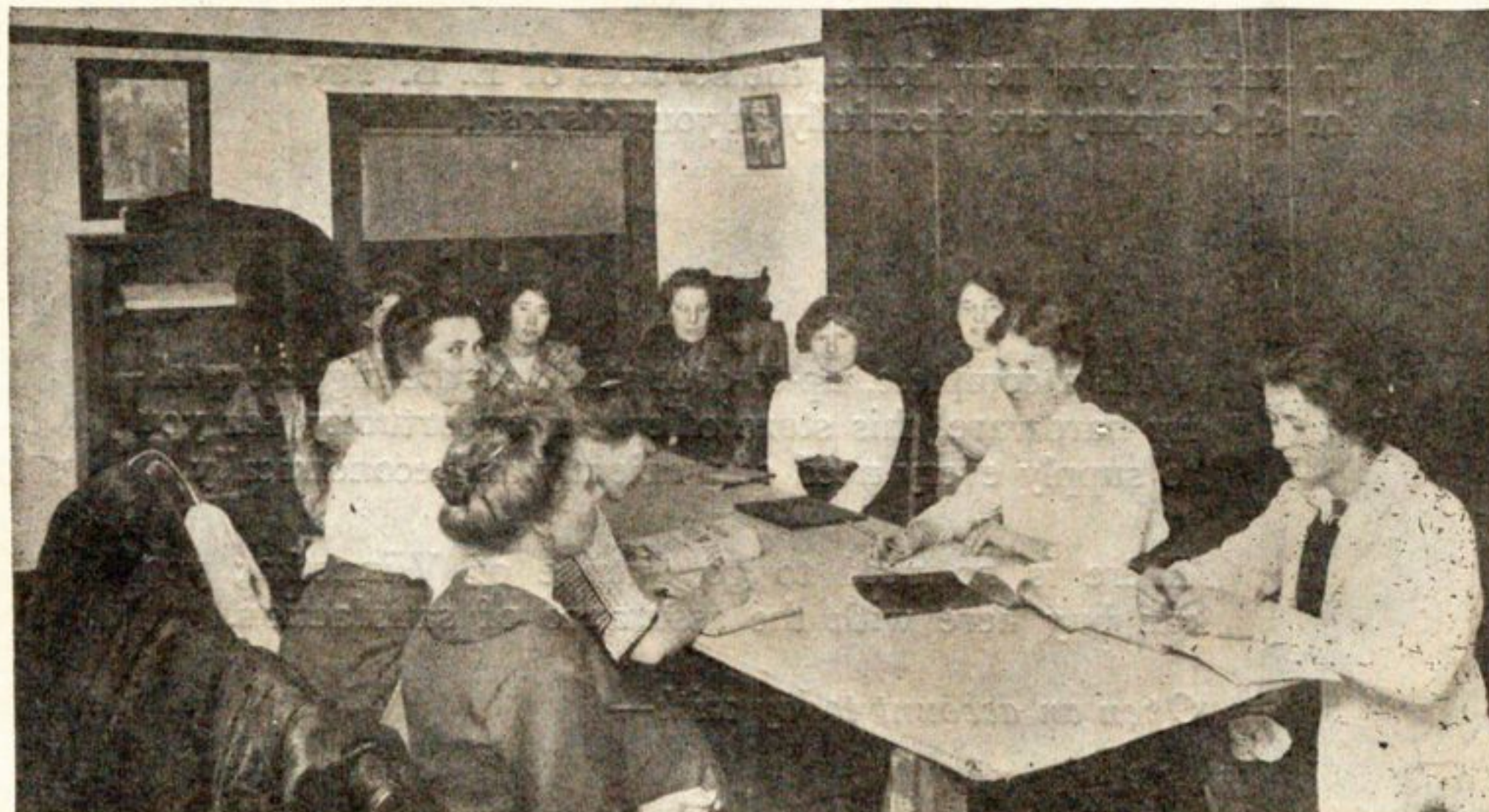
A Class in English for Foreign Born Residents