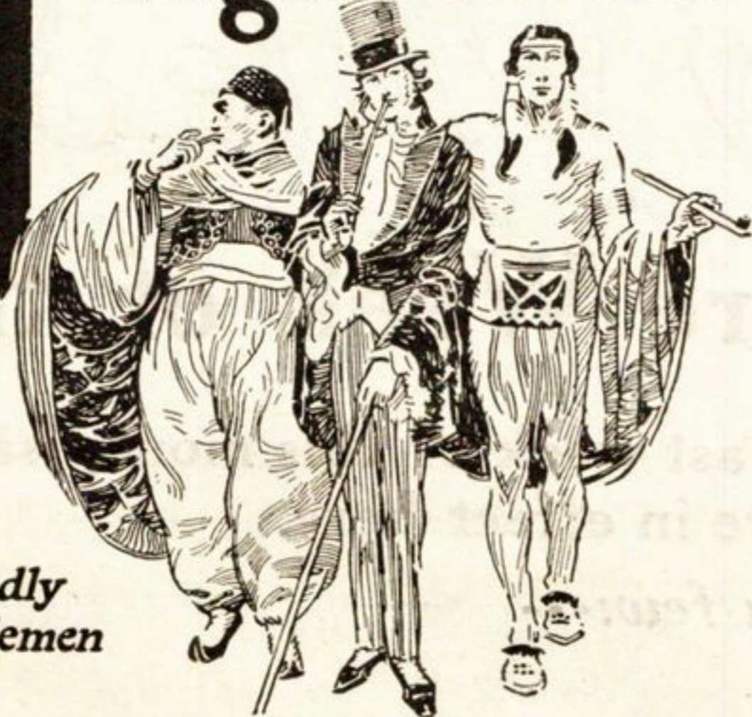
Three Friendly Gentlemen