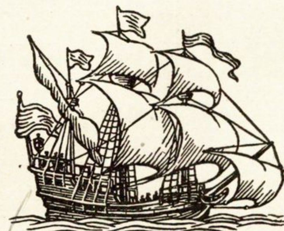
The MAYFLOWER 1620

This may be your last opportunity to secure some of these exclusive garments for "Almost Nothing." Time Flies.