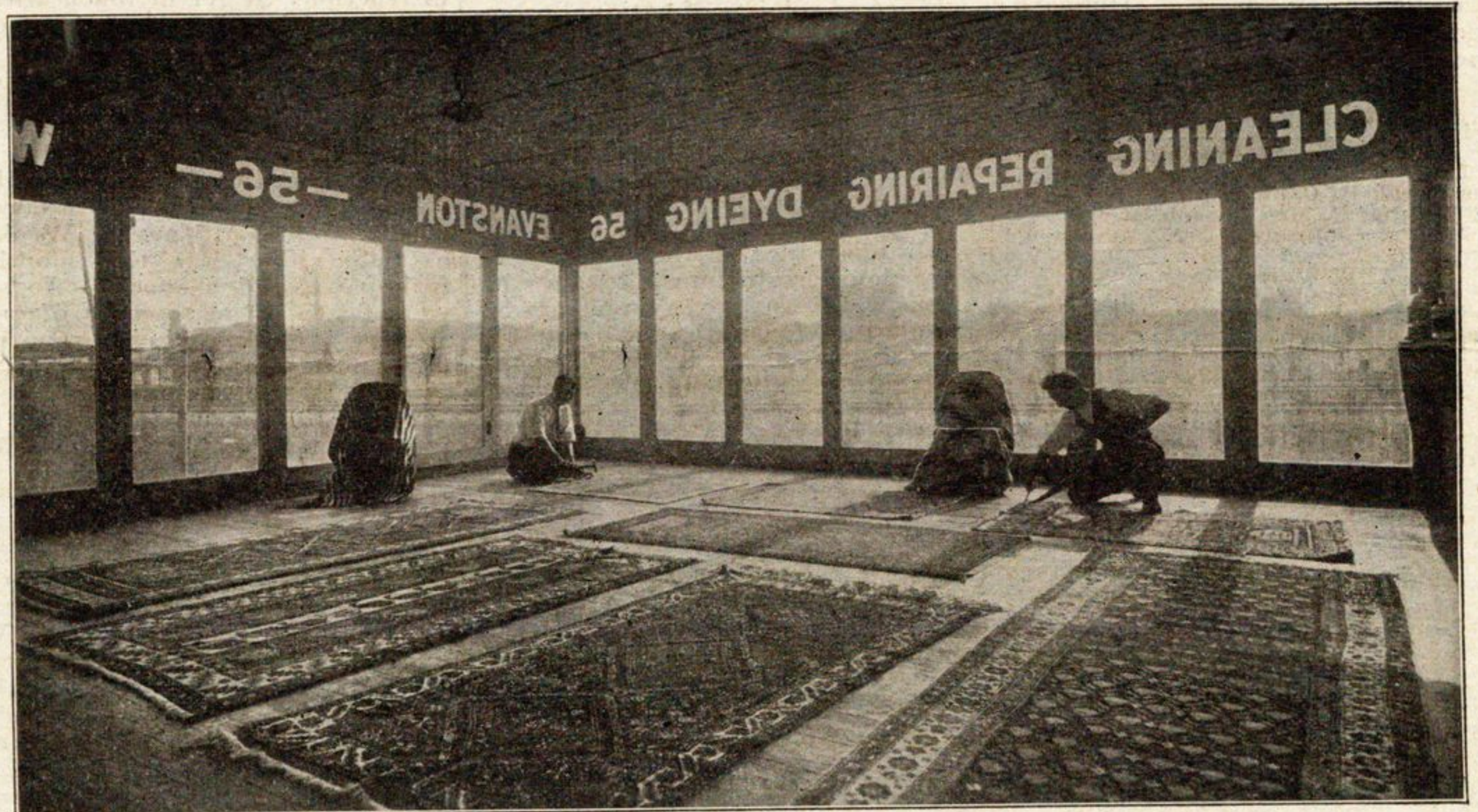
Sun Parlor: 30x40 feet. The picture tells the story more graphically. It is airy, clean and sunlit. In the process of cleaning and sizing, the rugs are given a sunbath. A particular degree of warmth, a precise amount of sun are relied upon to bring out the original lustre and beauty of the fabric.

The knowledge how to keep Oriental rugs in perfect condition is very important. "A stitch in time saves nine" is peculiarly applicable to Oriental rugs, and ought not to be forgotten. If you notice a hole or a break, have it repaired. Owing to the irregular tension exerted on the warp in weaving, often the borders of the carpet curl under and elevations appear in the center of the rug, which have a tendency to damage the rug considerably, if not attended to at once.