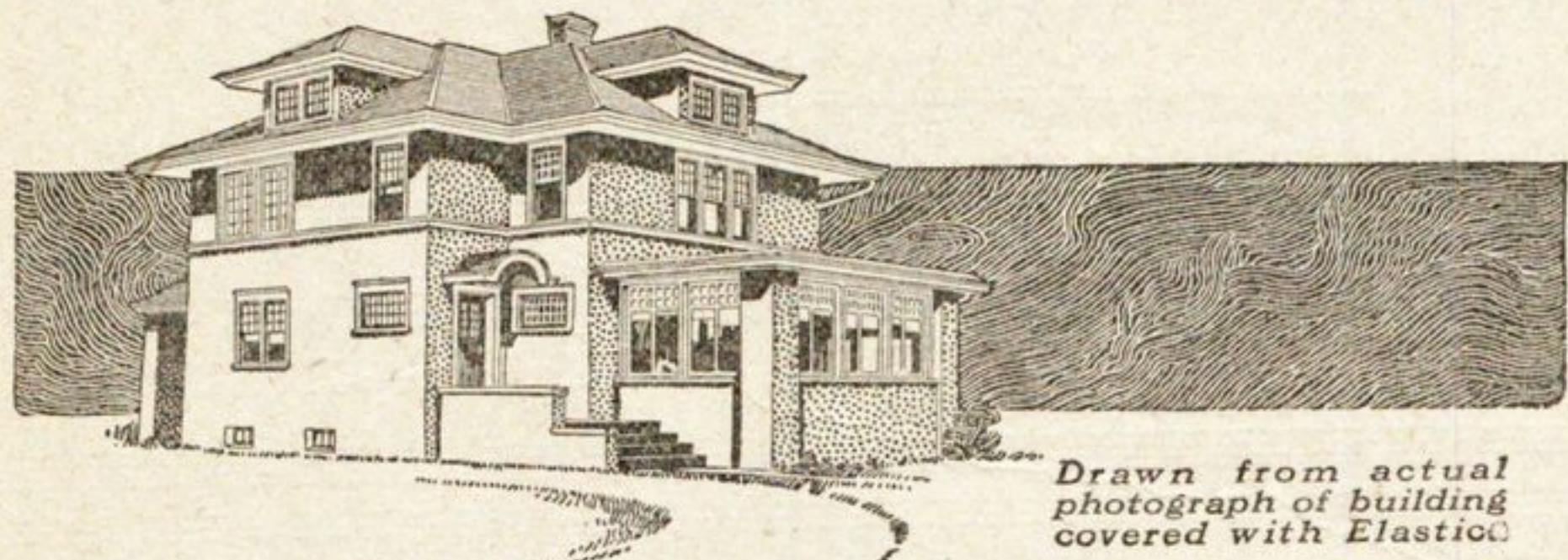
Drawn from actual photograph of building covered with Elastica.