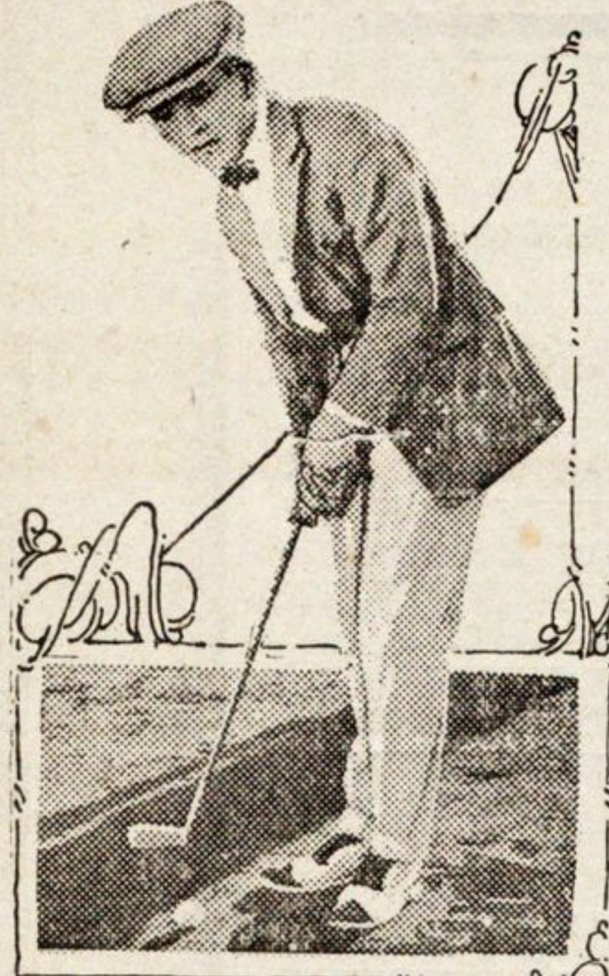
SESSUE HAYAKAWA LI TING LANG ROBERTSON-COLE

In response to an insistent demand from the public to see Sessue Hayakawa in Chinese roles, the management of the Community House an-