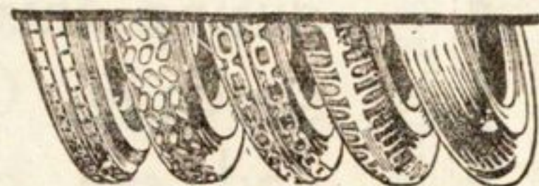
ROYAL CORD NOBBY CHAIN USCO PLAIN

For best results—everywhere—U. S. Royal Cords.