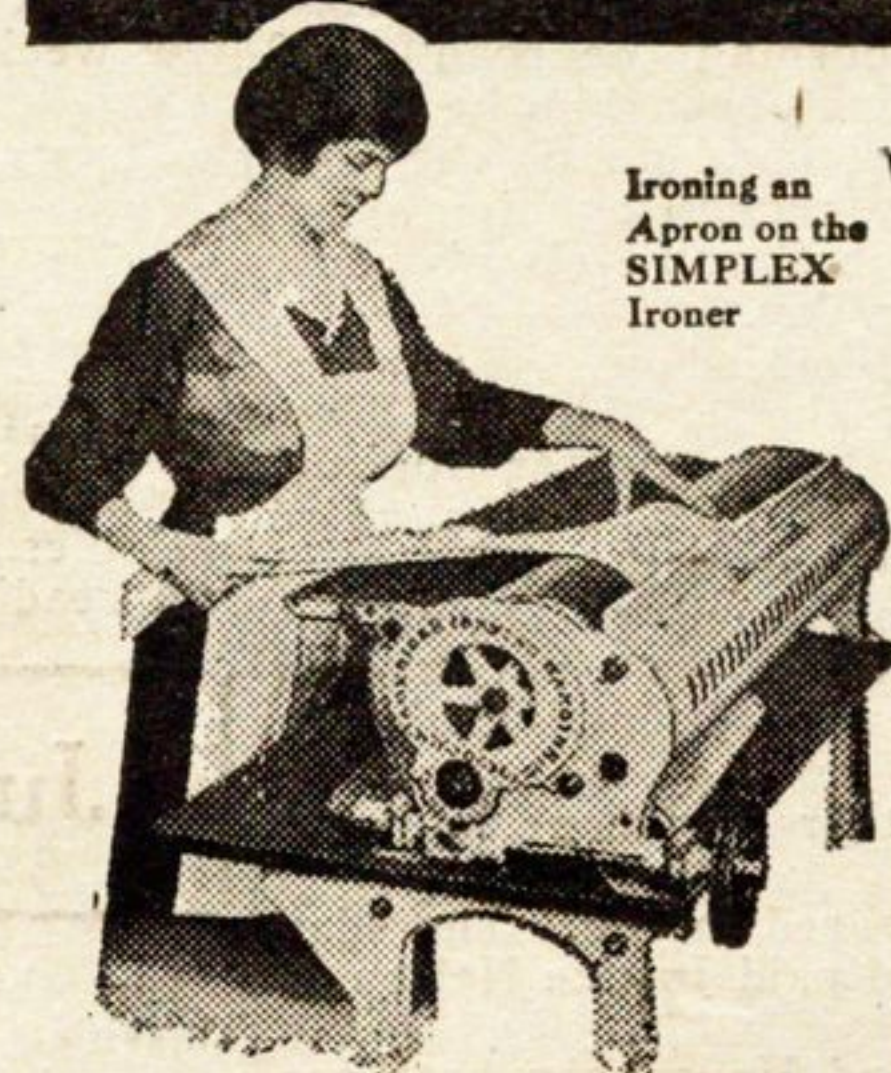
Ironing an Apron on the SIMPLEX Ironer

Step in and see our special demonstration of the SIMPLEX IRONER "THE BEST IRONER"