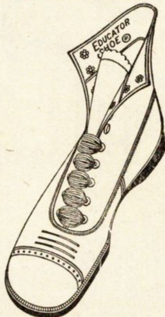
Black and Brown