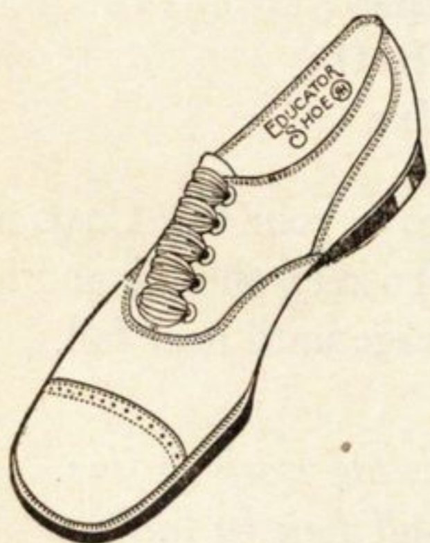
Black and Brown

Shoes for the Whole Family Our Price In Reach of All