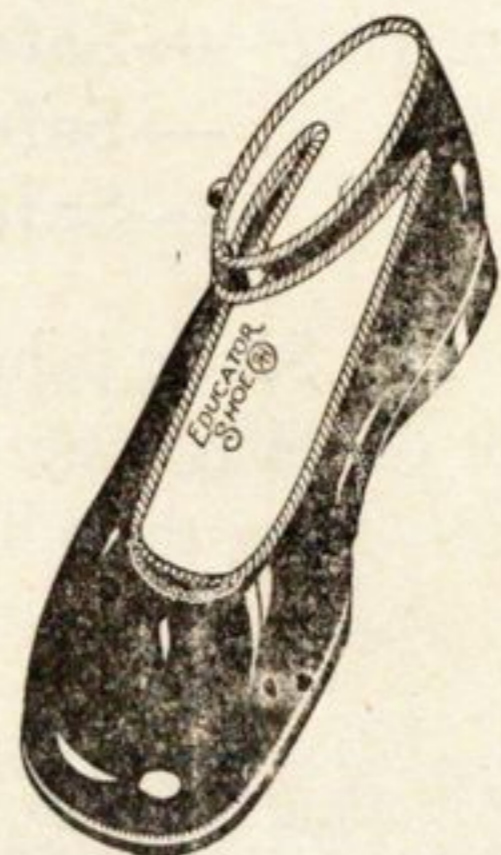
Patent Leather and Gunmetal