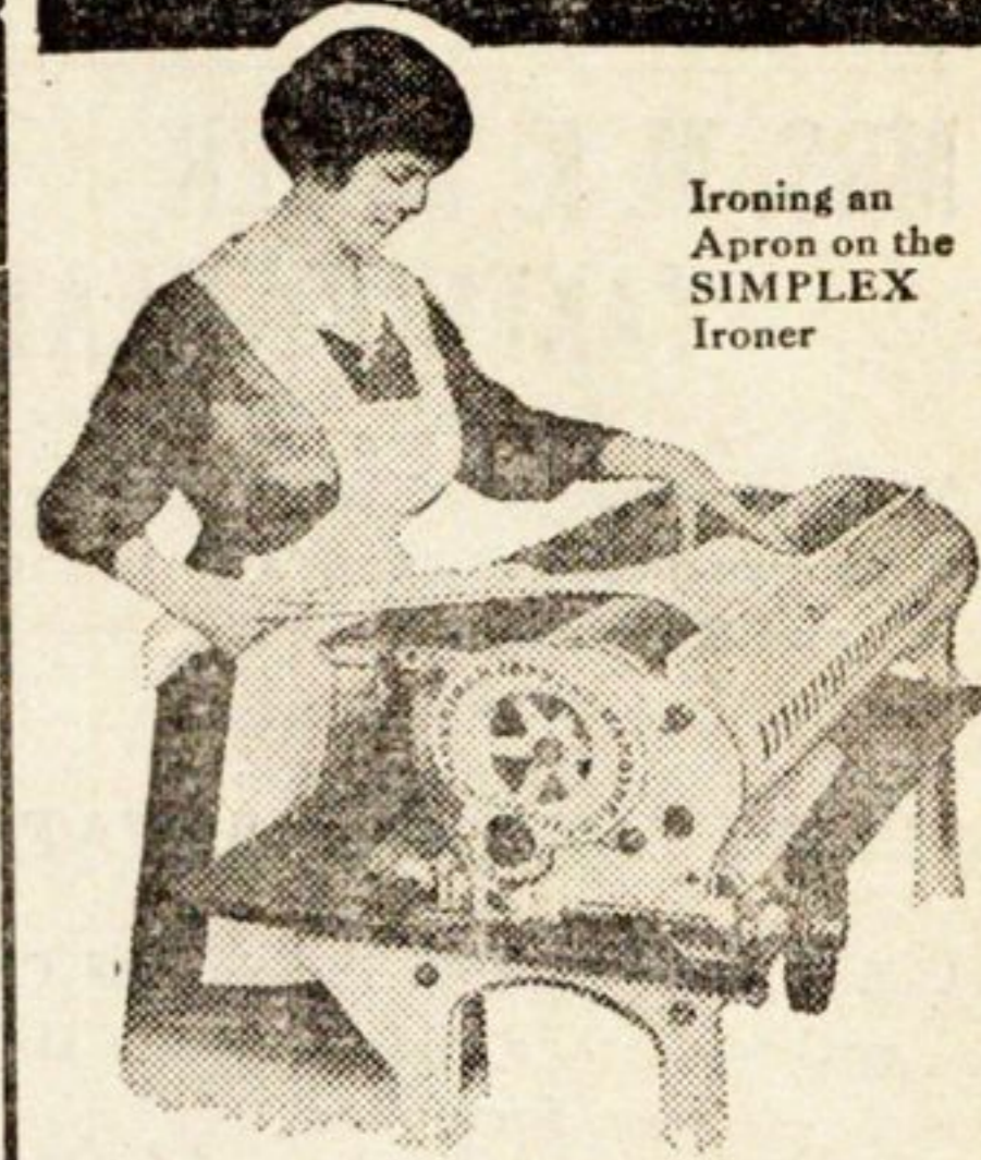
Ironing an Apron on the SIMPLEX Ironer

Step in and see our special demonstration of the