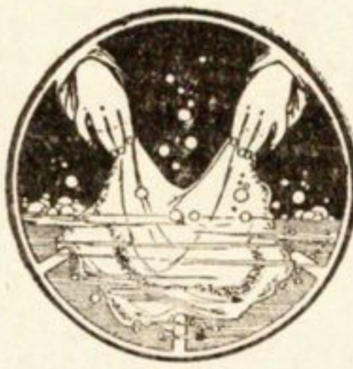
The ideal way of washing delicate things is the way the Eden washes everything.

The carrier pigeons and equipment of the navy department will be available for the department of agriculture next season for conveying messages from forest fire fighters "at the front" to headquarters, says a recent communication from the department of agriculture, Washington,