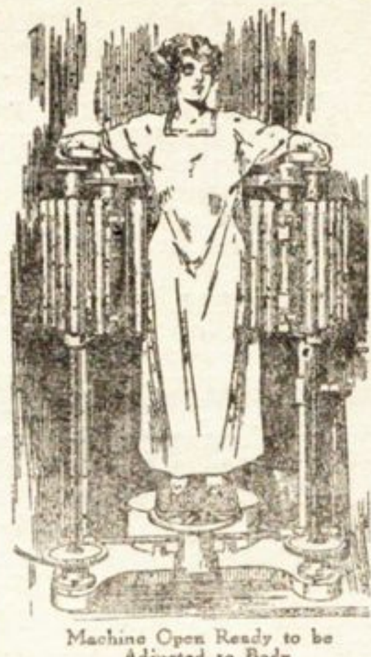
Gardner's Reducing Machine