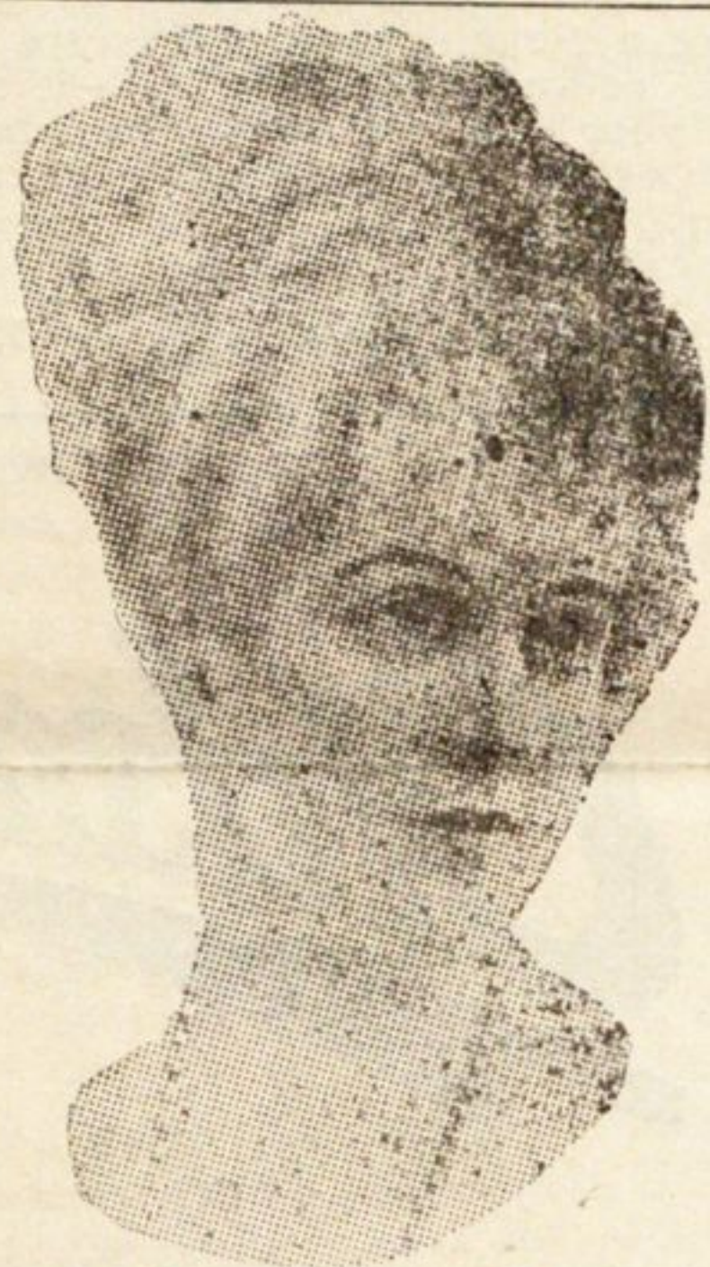
Established in 1916

WABASH 8704 McDOWELL DRESSMAKING AND DRESSCUTTING SCHOOL We teach high grade designing and sewing School open year around. Easy Terms Take Advantage of Summer Rates. Night School Opens September 209 South State St. 720 Republic Building