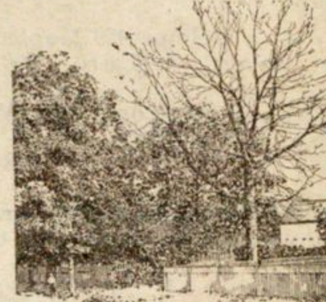
Trees on left were saved by Tree Tanglefoot

Write for free illustrated booklet on leaf-eating insects