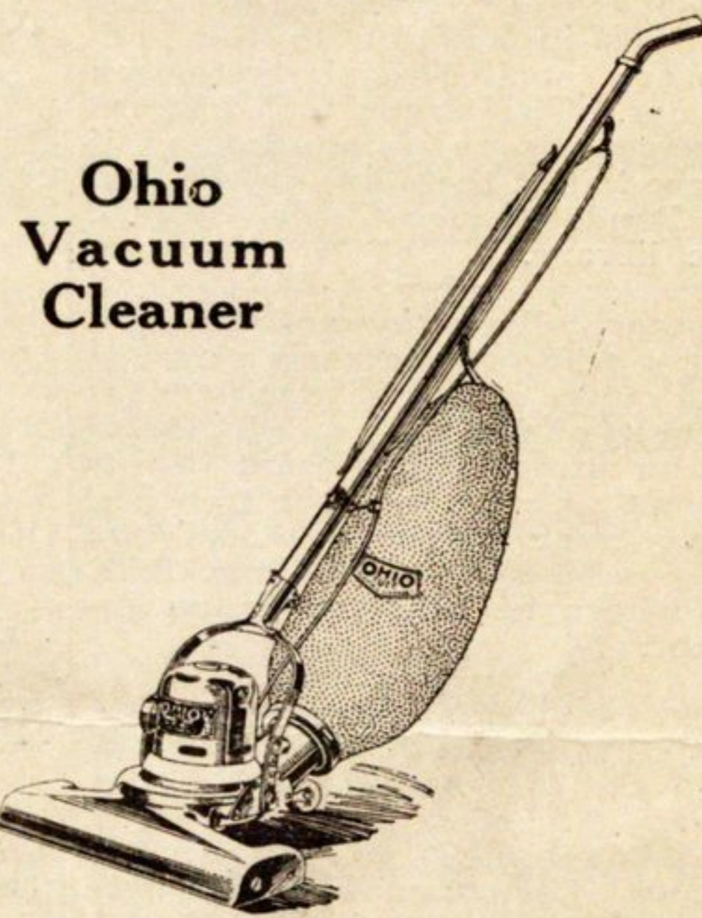
Ohio Vacuum Cleaner

ALL KINDS OF REPAIRING DONE Get your Christmas Tree Lights now. Only a few to be had. Bring your old sets for repair and new bulbs.