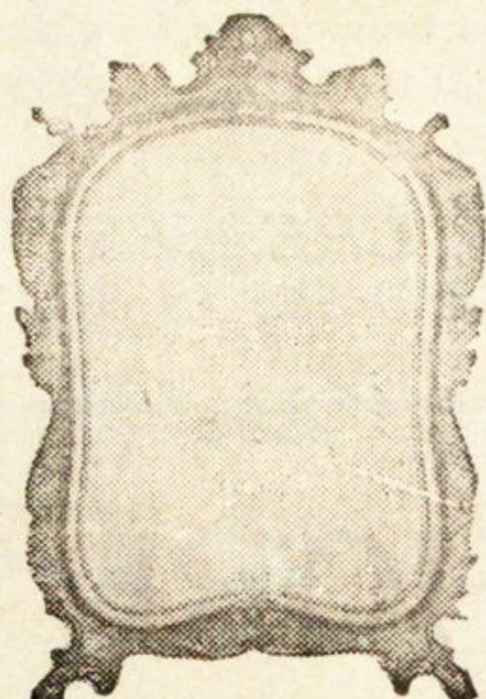
One of Our Stock Mirrors Makers of

NEWCOMB-MACKLIN CO. Factory and Salesroom N. State and Kinzie St., CHICAGO Salesroom 233 Fifth Ave., New York, N. Y.