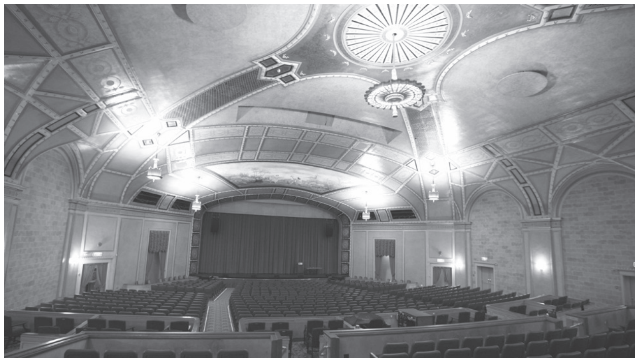
The Sanderson Centre for the Performing Arts, Brantford, Ontario