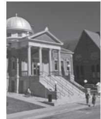
Wilfrid Laurier University Campus, Brantford, Ontario

Thanks to the work of these and many others, Laurier's Brantford campus now stands as a testament to the conviction—shared by the university, the City of Brantford and the County of Brant—that post-secondary education can play a transformational role in a community.