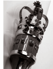
Detail of the Wilfrid Laurier University Mace

The Award for Service Excellence and Community Engagement for Faculty and Librarians recognizes individuals who in addition to their teaching and scholarship, provide exceptional service leadership.