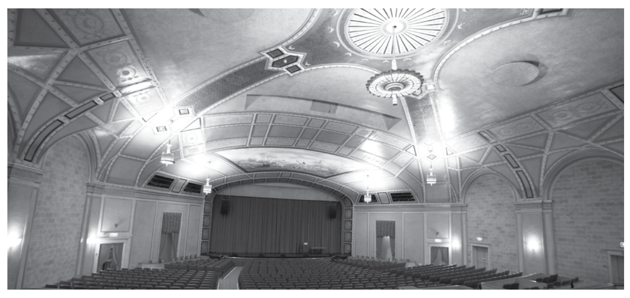
The Sanderson Centre for the Performing Arts, Brantford, Ontario