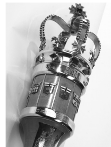
Detail of the Wilfrid Laurier University Mace

The head of the mace is made of maple and bears the Federal Coat of Arms, above which is the monogram of Queen Elizabeth II, during whose reign the university's charter was granted. On the reverse side is the crest of Wilfrid Laurier University and the monogram of King George V, during whose reign the original charter was granted. The top of the mace is a crown, mounted with jewels, symbolizing the authority of the State.